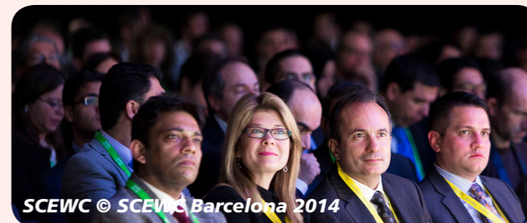
SCEWC © SCEWC Barcelona 2014