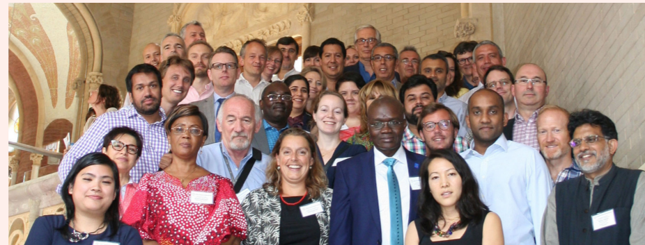
Participants at the gathering in Barcelona.

Throughout the consultations, lessons were drawn from local government representatives who are dealing with recent and ongoing urban crises in Senegal, Bangui (CAR), Banda Aceh (Indonesia) and Turkish cities where refugee influx has doubled the population without extra resources to ensure basic services. In addition, participants articulated key principles in a draft 'charter' as the basis for a Global Urban Partnership, pooling knowledge, capacity and resources to take this agenda forward. The consultation ended with a marketplace designed to connect key partners together to help shape these important initiatives.