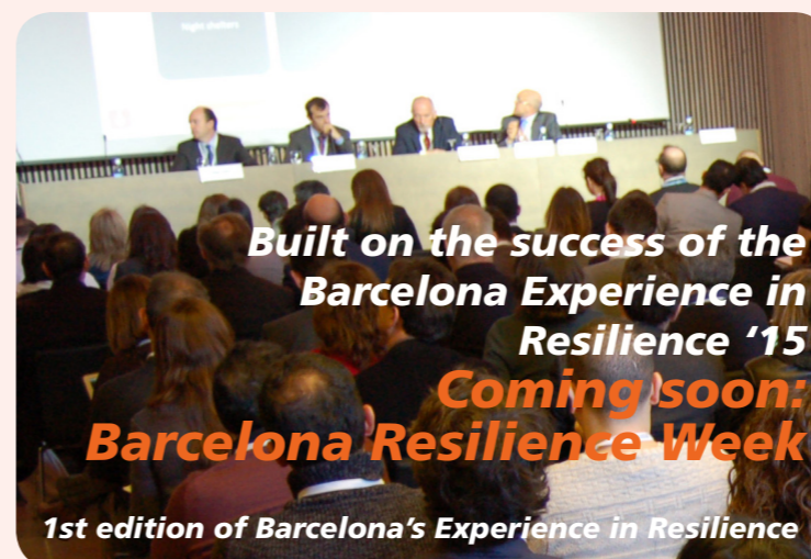
Built on the success of the Barcelona Experience in Resilience '15 Coming soon: Barcelona Resilience Week 1st edition of Barcelona's Experience in Resilience