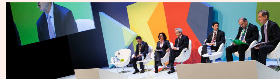
Speakers at one of the sessions of the SCEWC 2014

On Wednesday 18, a parallel session on Habitat III – Towards a New Urban Agenda, will have a slot to highlight the importance of the Conference on Housing and Sustainable Urban Development to take place in Quito, Ecuador, from 17 – 20 October 2016. Considered as one of the thematic meetings which are based on specific and relevant topics will issue thematic recommendations for the preparatory process towards Habitat III.