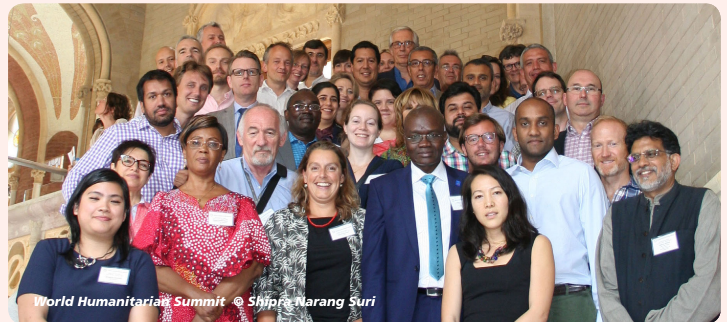
World Humanitarian Summit © Shipra Narang Suri