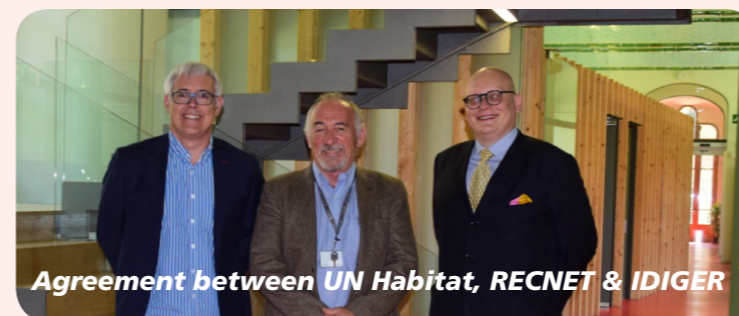
Agreement between UN Habitat, RECNET & IDIGER