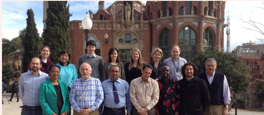
Participants at the CRPP Partner Cities Summit.

For two days, CRPP Focal Points and local government representatives from Balangoda (SRL), Cagayan de Oro (PHL), Barcelona (SPA), Dar es Salaam (TZA), Beirut (LBN), Tehran (IRN), Lokoja (NGA), and Bogota (COL) as a representative of the CRPP Associate City Network, gathered in this intensive working session to review and share progress and results in the implementation of the CRPP Tool in their cities. The discussion forum supported the exchange of information, challenges and opportunities for both, cities and CRPP, during the process.