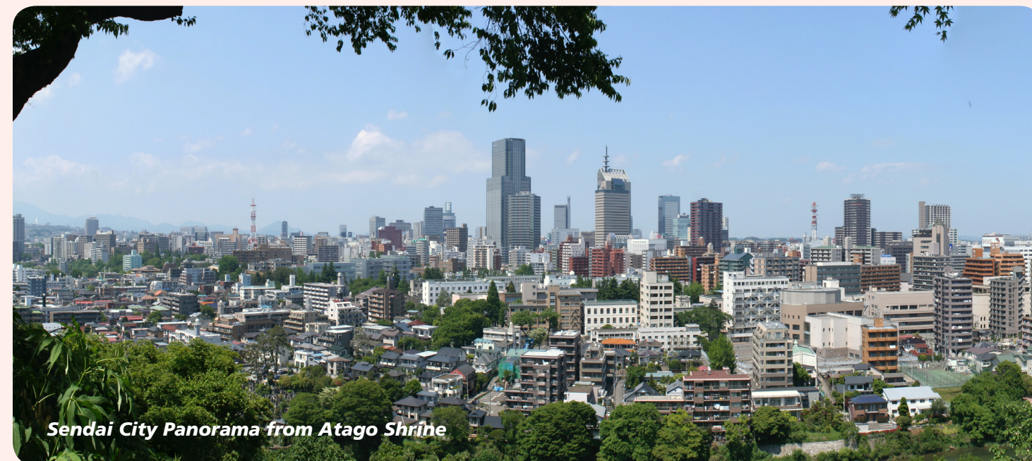
Sendai City Panorama from Atago Shrine