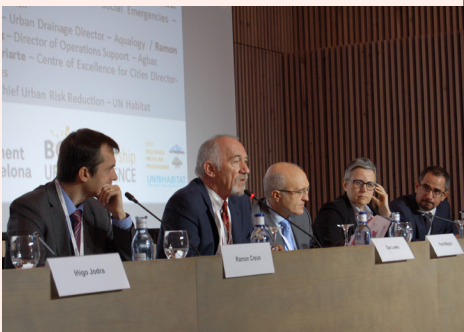
Barcelona's Experience in Resilience