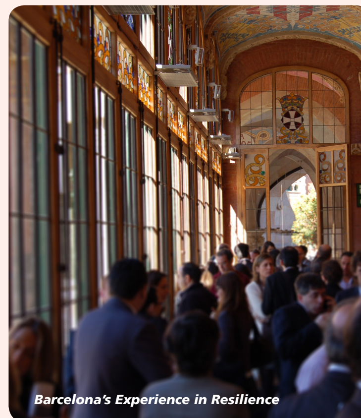
Barcelona's Experience in Resilience