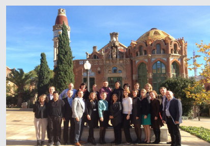
Delegates at the Medellín Collaboration on Urban Resilience Workshop

The workshop brought together more than 20 attendees from the public and private sectors, including several members from the Collaboration, which includes UN-Habitat, the United Nations Office for Disaster Reduction (UNISDR), The Rockefeller Foundation, 100 Resilient Cities – Pioneered by the Rockefeller Foundation, the World Bank, the Inter-American Development Bank, the Global Facility for Disaster Reduction and Recovery, the C40 Cities Climate Leadership Group, and ICLEI-Local Governments for Sustainability.