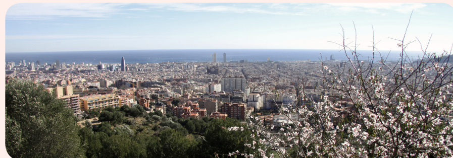
Barcelona, Spain

In this respect, I would like to highlight the tight collaboration with CRPP's working team, based in Barcelona, in the description of a systemic and holistic approach to measure resilience, fully in line with the current development of the city's Resilience Plan, and an essential tool to help identify the main lines of action and measures to be implemented in order to reduce the vulnerabilities of the city.