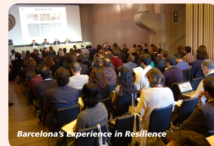
Barcelona's Experience in Resilience