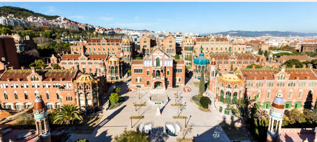
URI is located in Sant Pau Art Nouveau Site in Barcelona