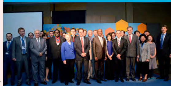
Dr Clos with C40 Mayors in Johannesburg.

Dr. Clos also congratulated Mayor Mpho Parks Tau of Johannesburg for leading a comprehensive urban re-development initiative, which includes the "Corridors of Freedom" project to redress the spatial segregation lines drawn under apartheid.