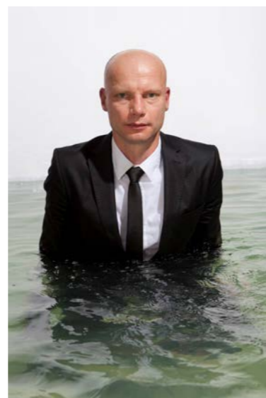
Henk Ovink is the Special Envoy for International Water Affairs for the Kingdom of The Netherlands