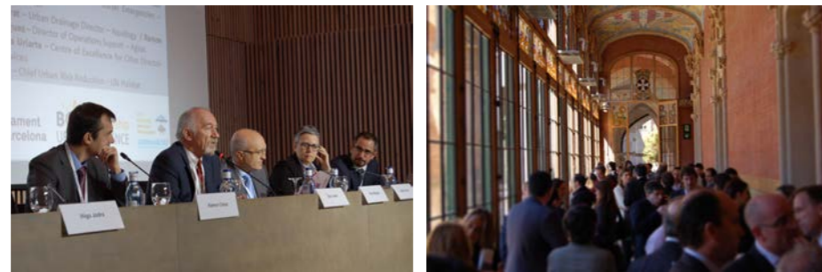
Last year's "Barcelona's Experience in Resilience"

In addition, organized site visits will offer a unique opportunity to participants to experience first-hand how Barcelona is strengthening its capabilities to become more resilient to a slew of threats. Side events have also been organized with outside organizations, including an exhibition from the international design competition, "Designing Resilience in Asia" from the National University of Singapore School of Design & Environment. The Enginyers Industrials de Catalunya (EIC) will also be featured in a session, "Resilient Catalonia, Governance and Smart City to Face Crisis," exploring the concept of resilience and its impact in the Catalan territory. Furthermore, the Medellín Collaboration on Urban Resilience will host a session on the international perspective on Urban Resilience.