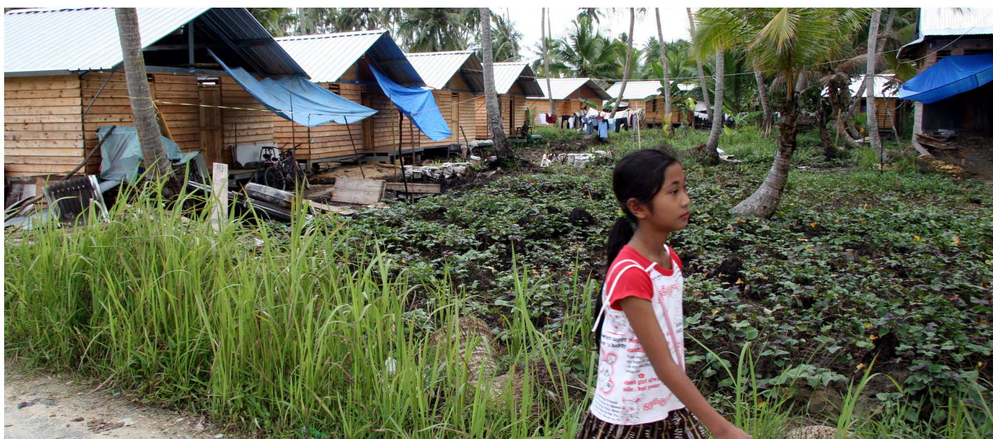
A girl walks past newly constructed houses in Aceh, Indonesia.