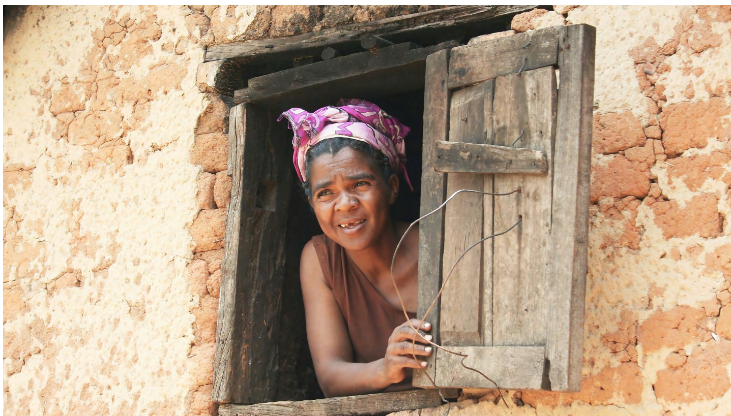
A woman peeps through a window in Madagascar. 2008.

Data on slums is available for all developing countries, as it has been reported yearly by UN-Habitat in the MDGs' reports. Recently, UN-Habitat has disaggregated information on this indicator at city level, increasing its suitability for SDG 11 monitoring. The people living in slums' indicator is currently measured in more than 320 cities across the world as part of UN-Habitat City Prosperity Initiative. UN-Habitat and World Bank computed this indicator for many years (1996-2006) as part of the Urban Indicators Programme. Data on inadequate housing, measured through housing affordability, is available for all OECD countries as well as in UN Global Sample of Cities covering 200 cities. Data on inadequate housing, measured through housing affordability, is available in many countries. UN-Habitat and World Bank computed this indicator for many years (1996-2006) as part of the Urban Indicators Programme. Recently, the Global Housing Indicators Working Group, a collaborative effort of Cities Alliance, Habitat for Humanity International, the Inter-American Development Bank, and UN-Habitat proposed the collection of data on this indicator worldwide.