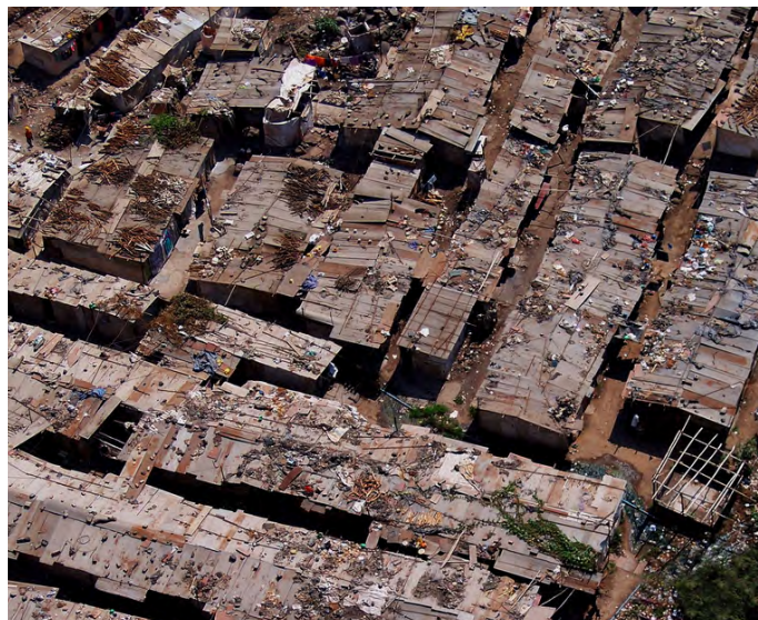
The picture a slum in Mumbai, India @panoramio.com.