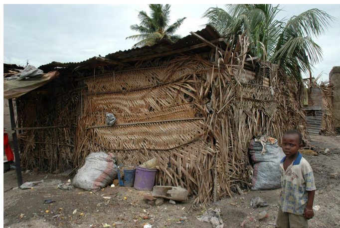
Manzese fragile structures, Tanzania. 2005 © UN-HABITAT / Suzi Mutter.

Regional and global estimates will be derived from national figures with an appropriate disaggregation level. Specialized tools will be developed and agreed upon with local and international stakeholders. Systems of quality assurance on the use of the tools, analysis and reporting will be deployed regionally, and globally to ensure that standards are uniform and that definitions are universally applied. We expect that investments in improved data collection and monitoring at country level will help governments: a) improve reporting and performance; b) increase readiness to engage with multiple stakeholders in data collection and analysis and; c) have a better understanding of the strengths and weaknesses of existing slum definitions and their applications.