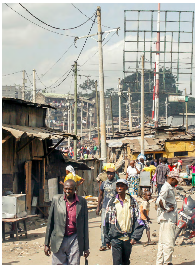
A busy street in Mathare slum Nairobi, Kenya 2016 © Julius Mwelu / UN-Habitat.

As per the 2030 Agenda, it is necessary to identify and quantify the proportion of the population that live in slums, informal settlements and those living in inadequate housing in order to inform the development of the appropriate policies and programmes for ensuring access for all to adequate housing and the upgrading of slums