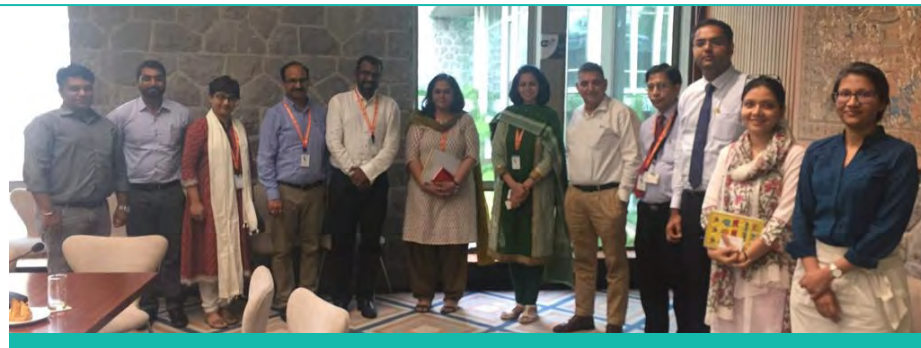
Participants at the first Indian NPAG meeting

The PAG bring together relevant stakeholders as an expert group that provides practical and strategic advice to the country project team for effective implementation of the project. The Indian PAG met for the first time in May 2019. Read the full story here