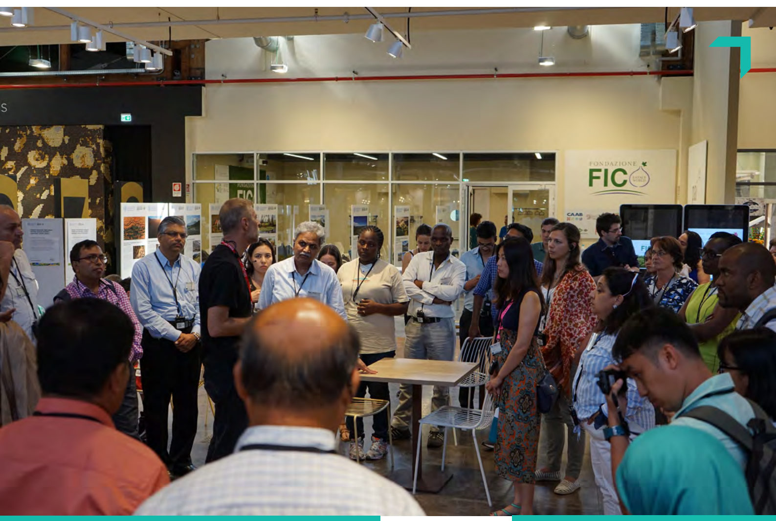
Participants during the 2019 Urban-LEDS European Study Tour