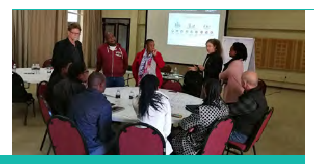
Unpacking integrated MRV in South Africa