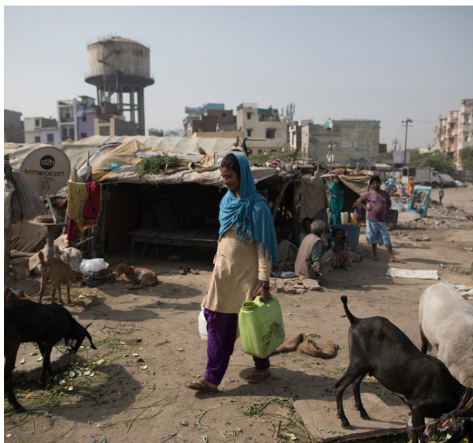
A woman carries jerrycans of water from a municipal water pipe off a main road

Countries will be expected to have their own dashboards for presenting this data and information. Examples of easy to use tools for presenting the data as a dashboard will be provided to various countries via the national statistical systems/offices.