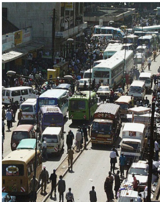
Situation of the public transport in Nairobi city, Kenya © urbanafrica.net.

Access to Basic Waste Collection Services refers to the access by the population to a reliable waste collection service, including both formal municipal and informal sector services. This is connected to SDG Indicator 11.6.1: ‘Proportion of urban solid waste regularly collected and with adequate final discharge out of total urban solid waste generated, by cities’. A ‘collection service’ may be ‘door to door’ or by deposit into a community container. ‘Collection’ includes collection for recycling as well as for treatment and disposal (so includes e.g. collection of recyclables by itinerant waste buyers). ‘Reliable’ means regular - frequency will depend on local conditions and on any pre-separation of the waste. For example, both mixed waste and organic waste are often collected daily in tropical climates for public health reasons, and generally at least weekly; source-separated dry recyclables may be collected less frequently.