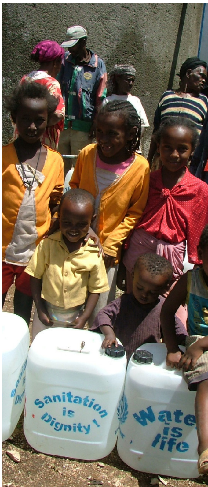
Jovial children after receiving water containers provided by UN-Habitat in Harar, Ethiopia.