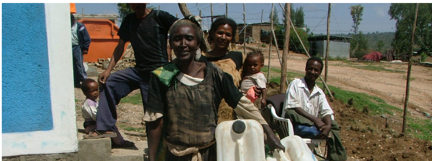
Clean water, a challenge for women in Harar town, Ethiopia.

To eradicate poverty, communities need to be connected to socio-economic opportunities by roads that are passable all season and attract reliable and affordable public transport services. In many areas, safe footpaths, footbridges and waterways may be required in conjunction with, or as an alternative, to roads. For reasons of simplification, specific emphasis was given to roads in this definition (based on the Rural Access Index - RAI) 3 since road transport reflects accessibility for the great majority of people in rural contexts. In those situations where another mode, such as water transport is dominant the definition will be modified and contextualized to reflect and capture those aspects.