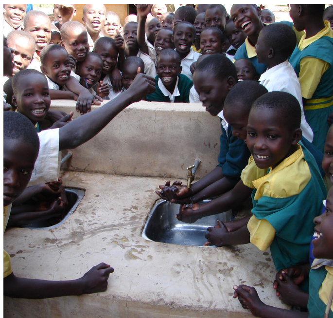
Schools sanitation project launch in Bondo, Kenya. 2010

Basic service delivery must move towards a demand-driven approach, which is appropriate for the local needs – and hence able to respond to the concept of "Access for all" – as stated in the NUA. Basic services are fundamental to improving living standards. Governments have the responsibility for their provision. This indicator will measure levels of accessibility to basic services and guide the efforts of governments for provision of equitable basic services for all as part of the national and global efforts to eradicate poverty.