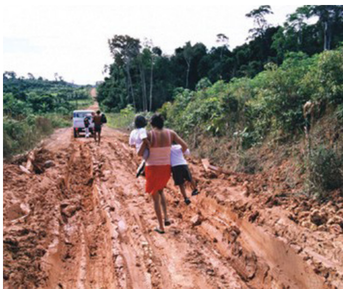
A family makes its way down a mud-filled road in Vila Da Canpas in the Amazon region of Brazil © selvavidasinfronteras.com.

As a basic underlying assumption, it is understood that women and men equally benefit from access to all-weather roads.