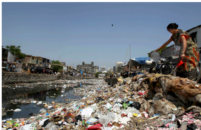
Urban waste in India ©urbanizehub.

Access to Basic Health Care Services refers to access to services that cover in and out-of-area emergency services, inpatient hospital and physician care, outpatient medical services, laboratory and radiology services, and preventive health services. Basic health care services also extend to access to limited treatment of mental illness and substance abuse in accordance with minimum standards prescribed by local and national ministries of health. This is connected to SDG 3.7.1 (health).