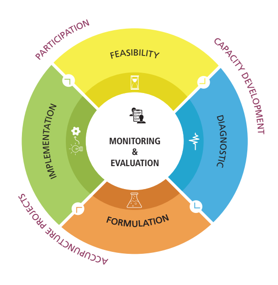
Figure 2. NUP Phases and Pillars

Feasibility : the first NUP phase where a case for mainstreaming URL is identified.