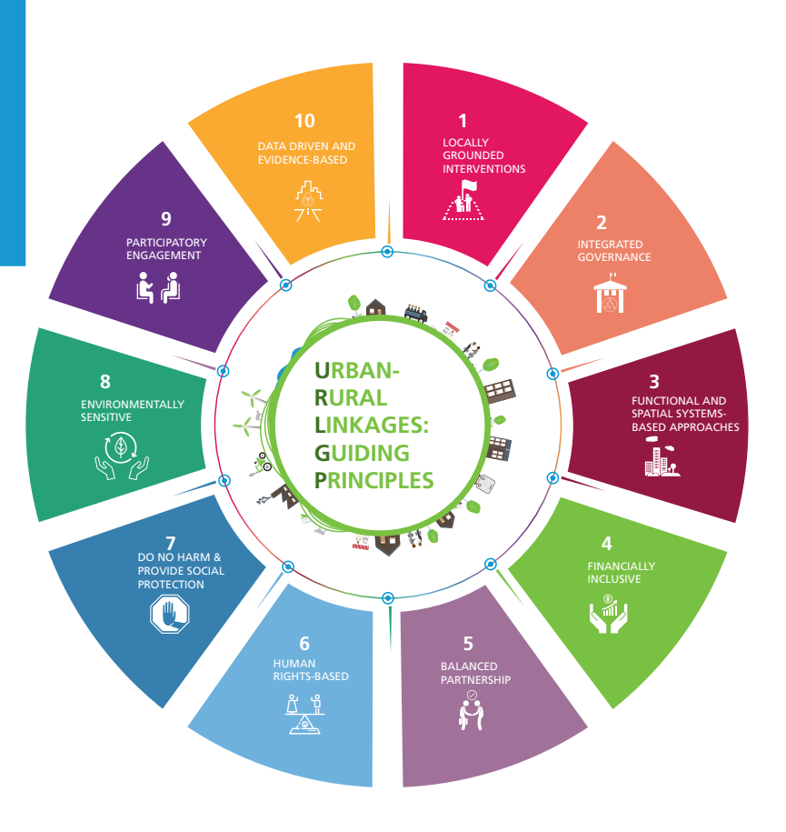
Figure 1 Urban-Rural Linkages: Guiding Principles