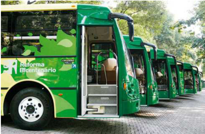
Implementation of line 1, 2 and 3 of the metrobus in Mexico City.