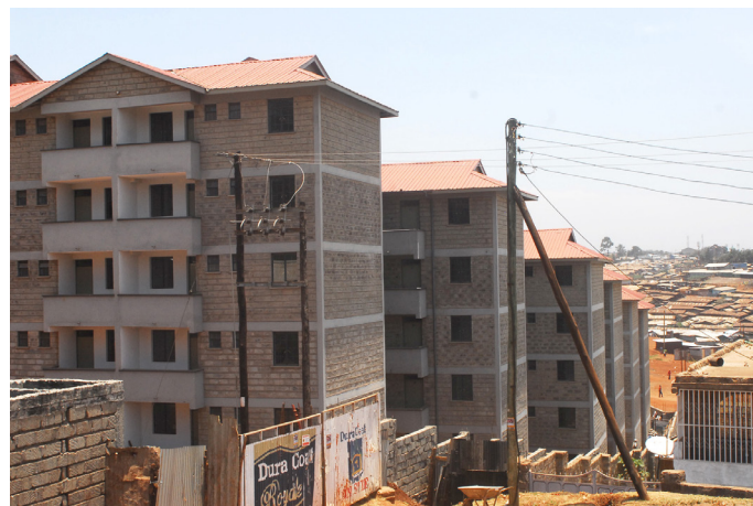
New flats built for Kibera residents under the initiative of the Kenya slum upgrading programme.

UN-Habitat has undertaken a comprehensive review of urban policies and the methodology forms the basis for the Global State of Urban Policy and Scorecard to be published every two years. Based on the baseline developed by UN-Habitat, it is feasible to routinely assess the status of national urban policies and ascertain the progress made by countries to develop and implement policies based on agreed qualifiers. The work will benefit from various ongoing initiatives of policies review and diagnostics undertaken by OECD, UN-Habitat and World Bank. Further methodological work would be needed to identify a list of criteria that have to be satisfied in order to attribute a value to the relevant development-oriented policy (i.e. Policies supporting job creation, innovation, land-use efficiency, public space, etc.).