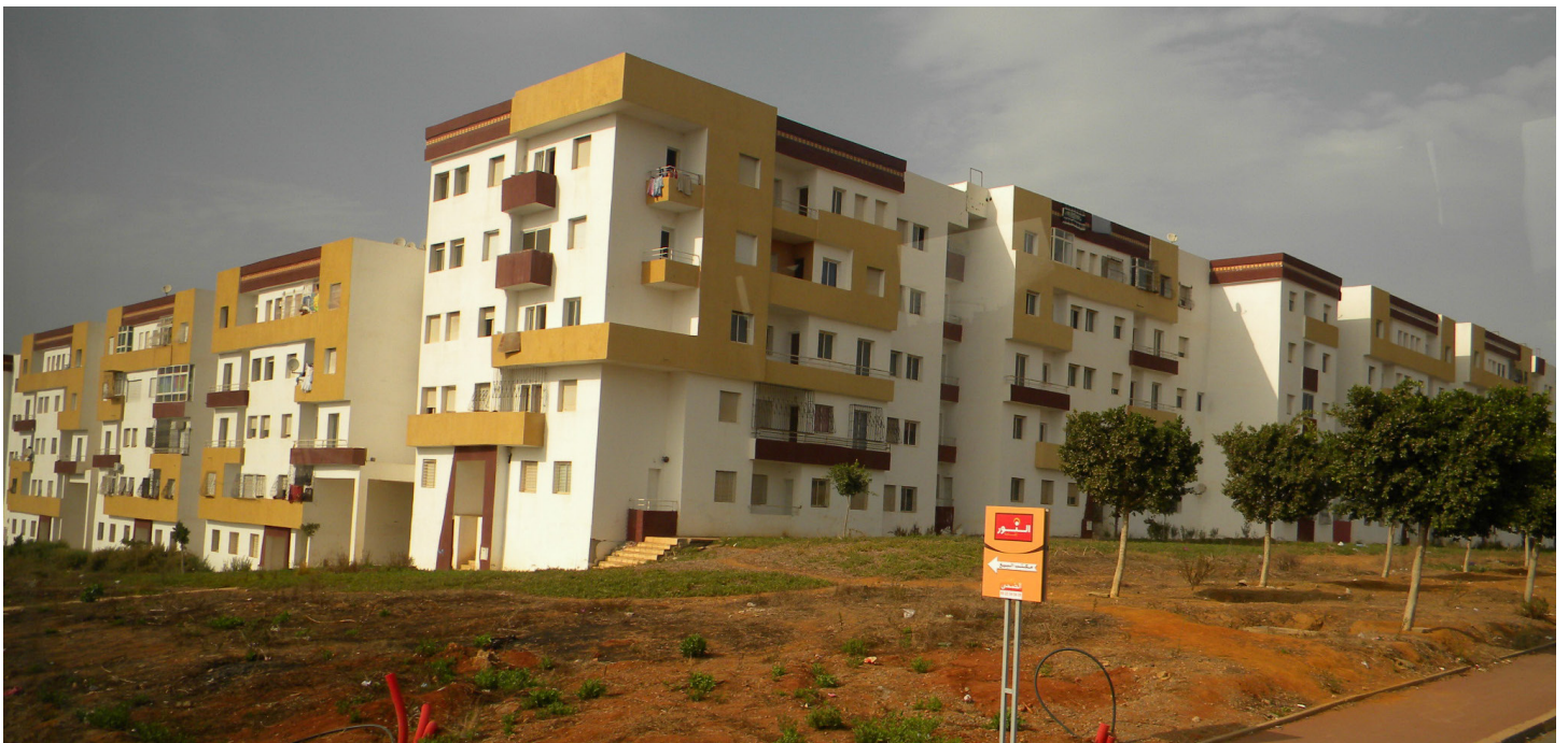
Newly constructed residential housing units in Rabat, Morocco