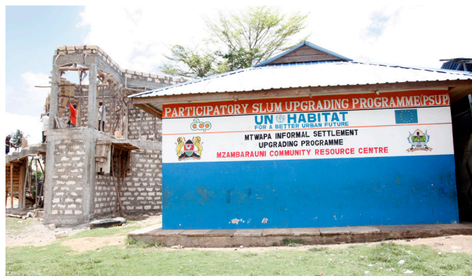
Mzambarauni Community Resource Centre in Kilifi, Kenya 2016

Countries that are counted as having national urban policies or regional development plans can still make efforts to improve the rating of the 3 qualifiers.