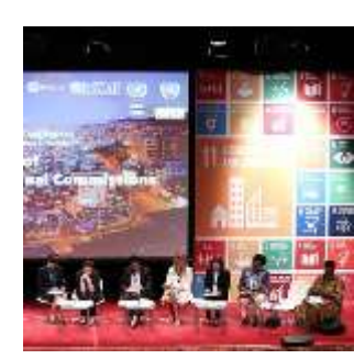
33 ONE UN events