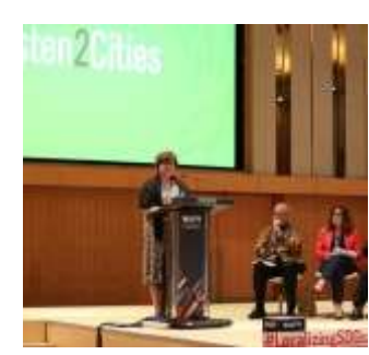
30 Listen to cities events