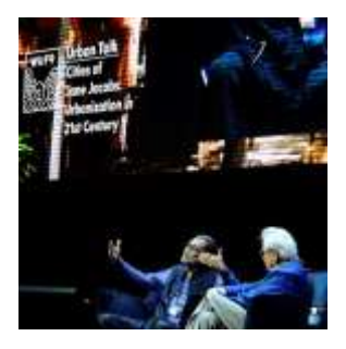
3 Urban Talks