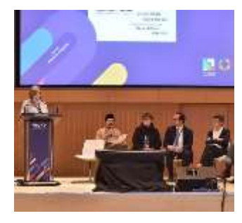
10 Plenary Meetings