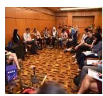
60 Training events