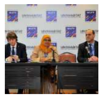
17 Press Conferences