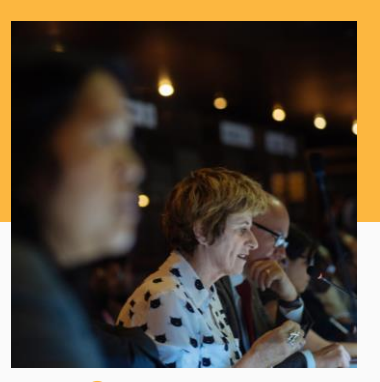
6 High-level Roundtables