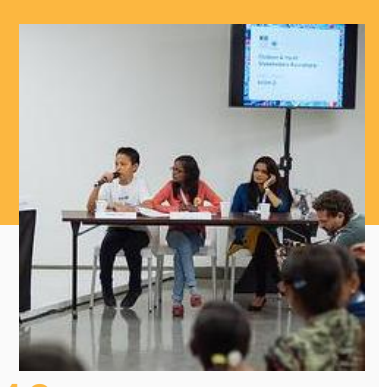
16 Stakeholders Roundtables