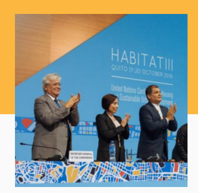
8 Plenary Meetings