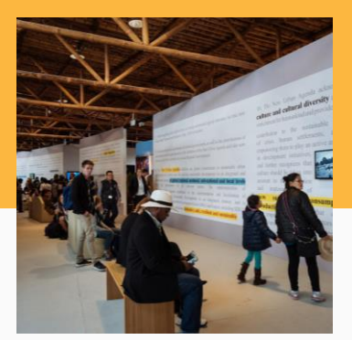
59 UN Events