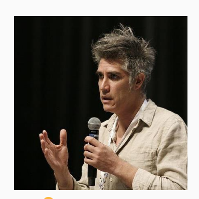
3 Urban Talks