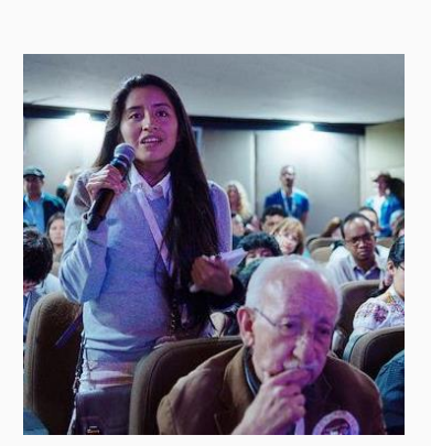
10 Policy Dialogues