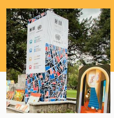
42 Habitat III Village Projects