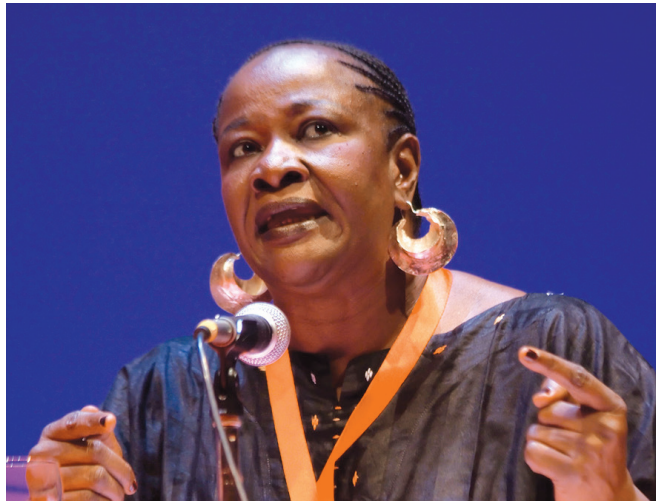
Aminata Dramane Traoré - Chair AGGI Author, politician, gender and political activist