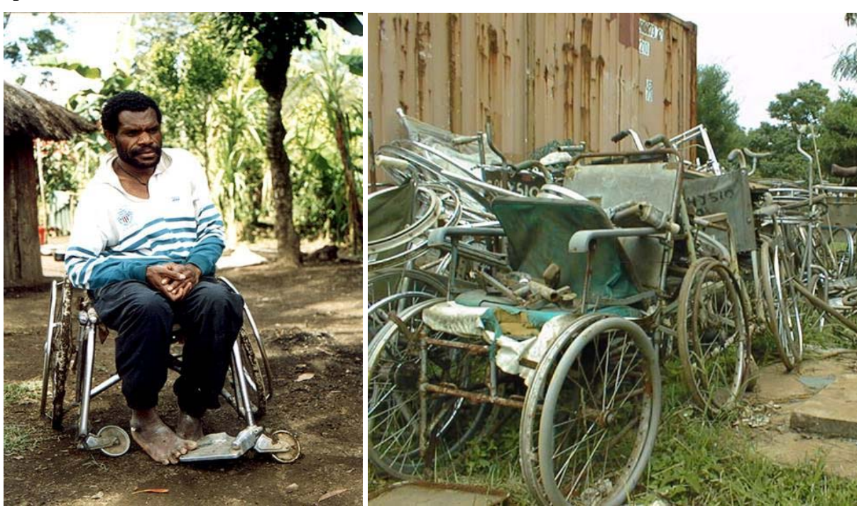
Figure 4. A pile of discarded inappropriate donated wheelchairs for which there are no spares in Tanzania