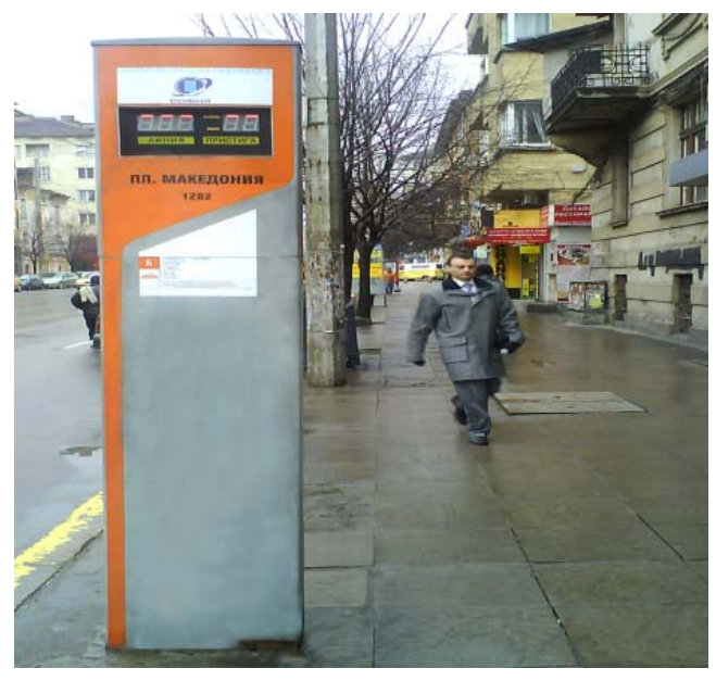
Figure 7. Audible and visual real time information at public transport stops in Sofia, Bulgaria

In some cities with a legacy of old inaccessible vehicles, measures are being taken to help specific disability groups. In Sofia, Bulgaria, the local authority has worked with the National Association of Blind People to install audible real-time information points at public transport stops (see Figure 7). Although the vehicles remain inaccessible to anyone with a physical disability, this innovation has started the move towards accessibility.<sup>29</sup> In Moscow, Russia, 600 bus stops have been modified with features to help visually impaired people.<sup>30</sup>