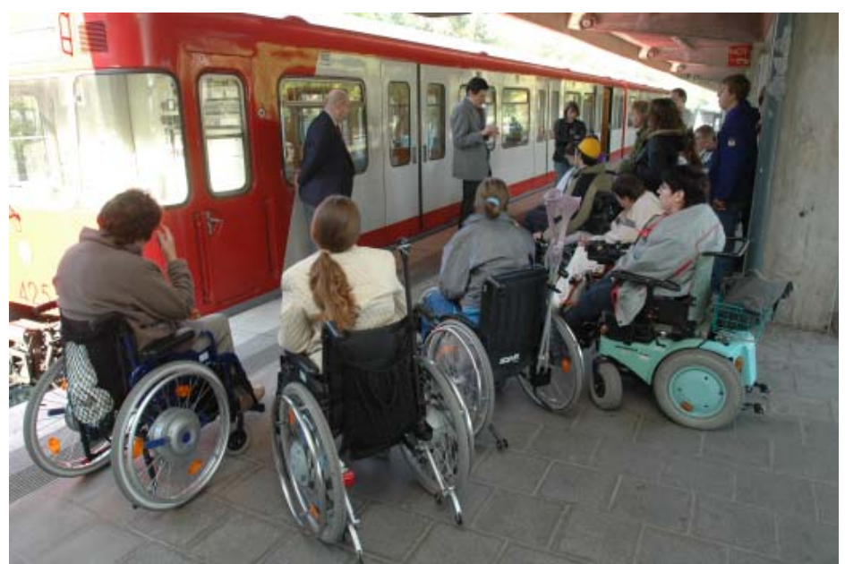
Figure 10. Familiarisation sessions for disabled people on the Metro system in Nürnberg, Germany