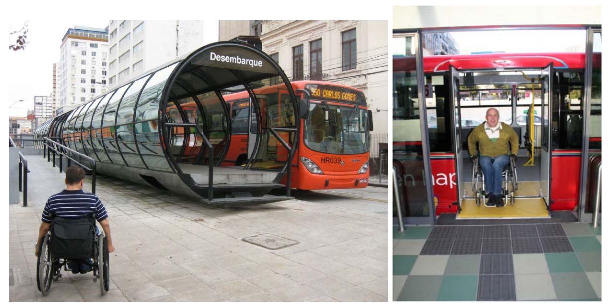
Figure 9. Accessible BRT in Cape Town, South Africa