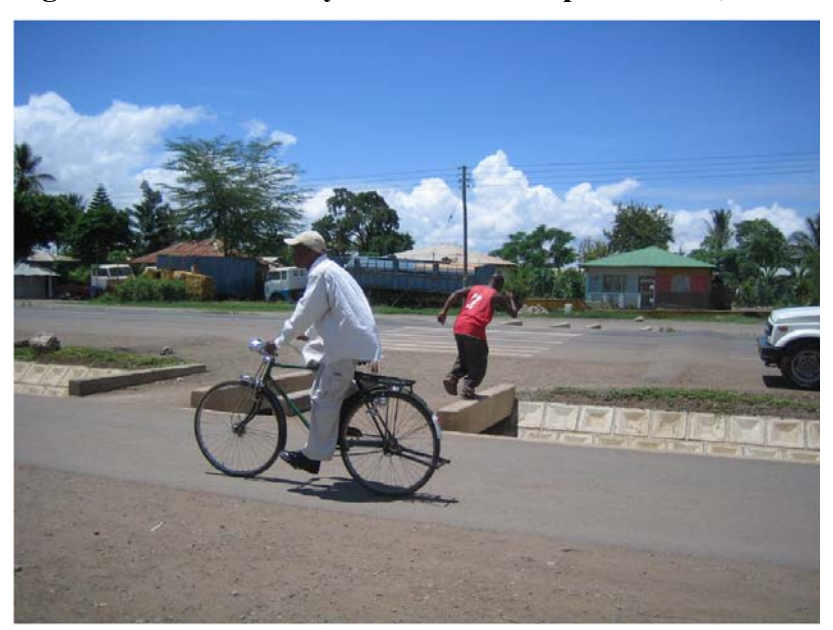
Figure 2. Good road layout for disabled pedestrians, Tanzania