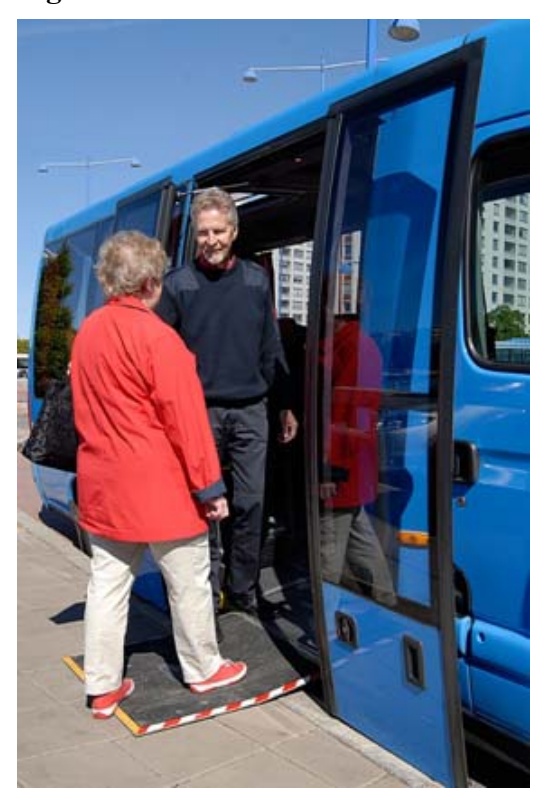
Figure 11. Flex line service in Göteborg, Sweden