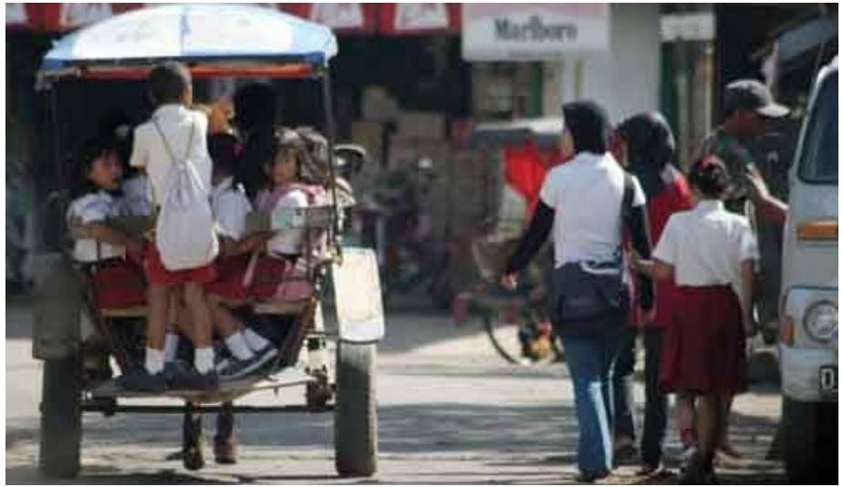
Figure 5. A delman overcrowded by a group of elementary school children in the busy street of Bandung