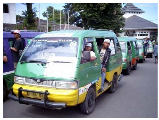
Figure 2. Angkots in the city centre