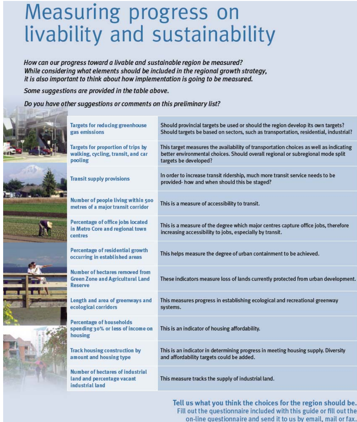
Figure 4. Example of GVRD soliciting feedback on indicators