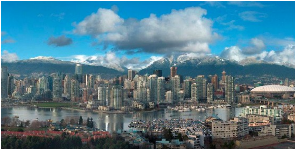
Figure 1. Downtown Vancouver

Vancouver appears “at or close to the top of nearly every international list of the best places to live” (Harcourt et al, 2007: 1). While its verdant coastal mountain setting contributes to its appeal, Vancouver’s innovative approach to public planning has been acknowledged in making it the “poster child of North American urbanism” (Berlowitz, 2005). The term “Vancouverism” has even entered the lexicon of urban professionals describing a philosophy and approach to planning characterized by “multiple-use, high density core areas; a transit-focused and auto-restrained transportation system; exquisite urban design to echo a spectacular natural setting; and peaceful, multicultural population” (Harcourt et al, 2007: 1). Its collaborative approach to urban development involving extensive public and stakeholder engagement has been recognized through a variety of awards and distinctions. Indeed, Vancouver was the host of the first United Nations Conference on Human Settlements in 1976, where its cutting edge participatory planning model was showcased to the world (Timmer and Seymoar, 2005).