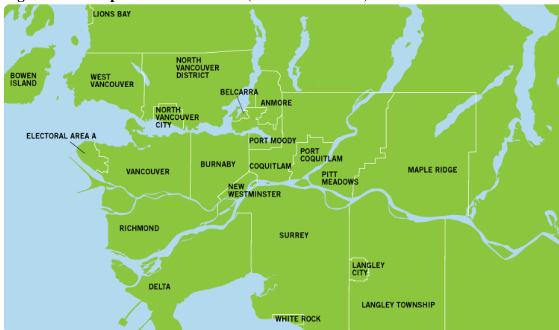
Figure 2. Municipalities of the GVRD (Metro Vancouver)