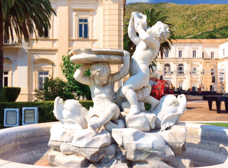
captions captions captions