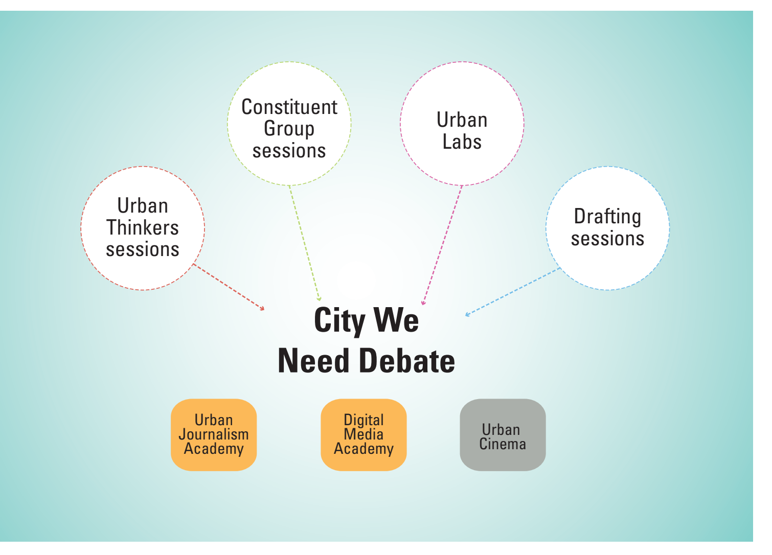
Figure 2: The Urban Thinkers Campus Model