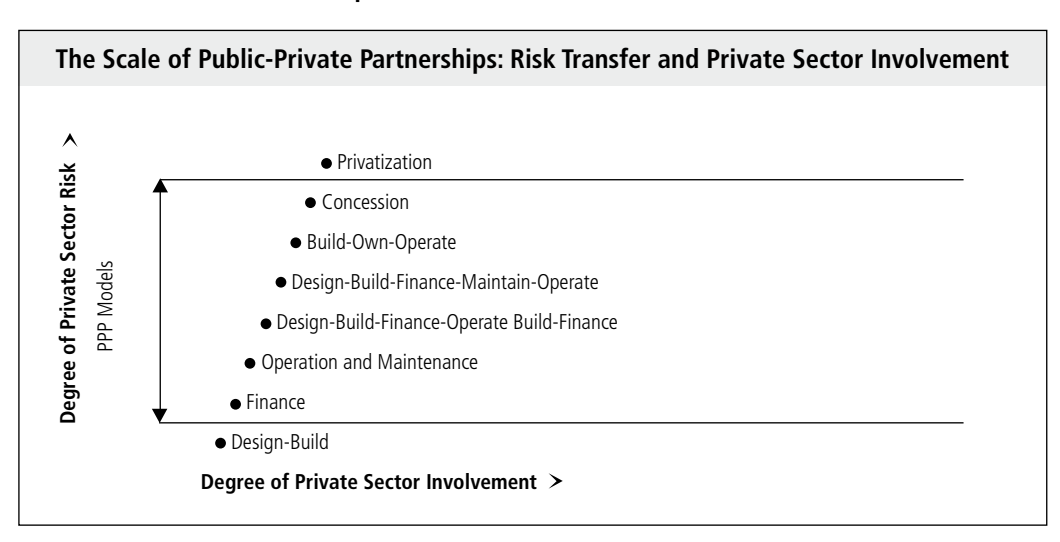
FIGURE 3: The Public-Private Spectrum and Model Definitions

While it is commonly cited that a 'true' form of PPP is a collaborative model where both the private and public sectors agree to share the risks and rewards of a particular project, there are a variety of approaches that illustrate the possible power-sharing and decision-making arrangements. A partnership with the private sector can fall under a consultative approach whereby the government seeks out expert advice from the private sector or community groups. There are also contributory arrangements which are identified as ones where the public sector provides funding to the private partner that is in turn responsible for carrying out the development and management of the