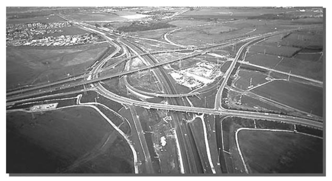
FIGURE 7: A View of Highway 6 in Israel