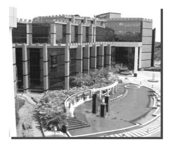
FIGURE 9: Manipal University Medical College in Manipal, India