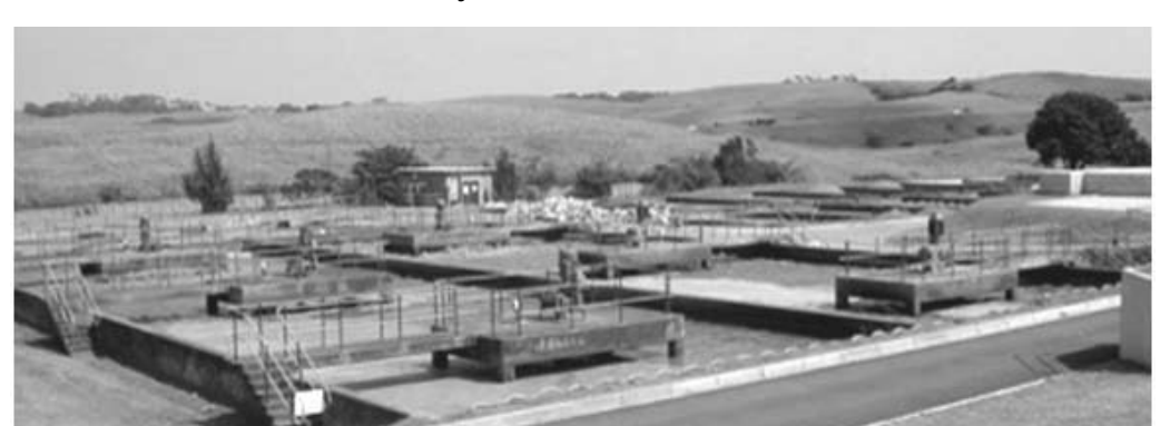
FIGURE 8: Ilembe District Community Water and Wastewater Plant