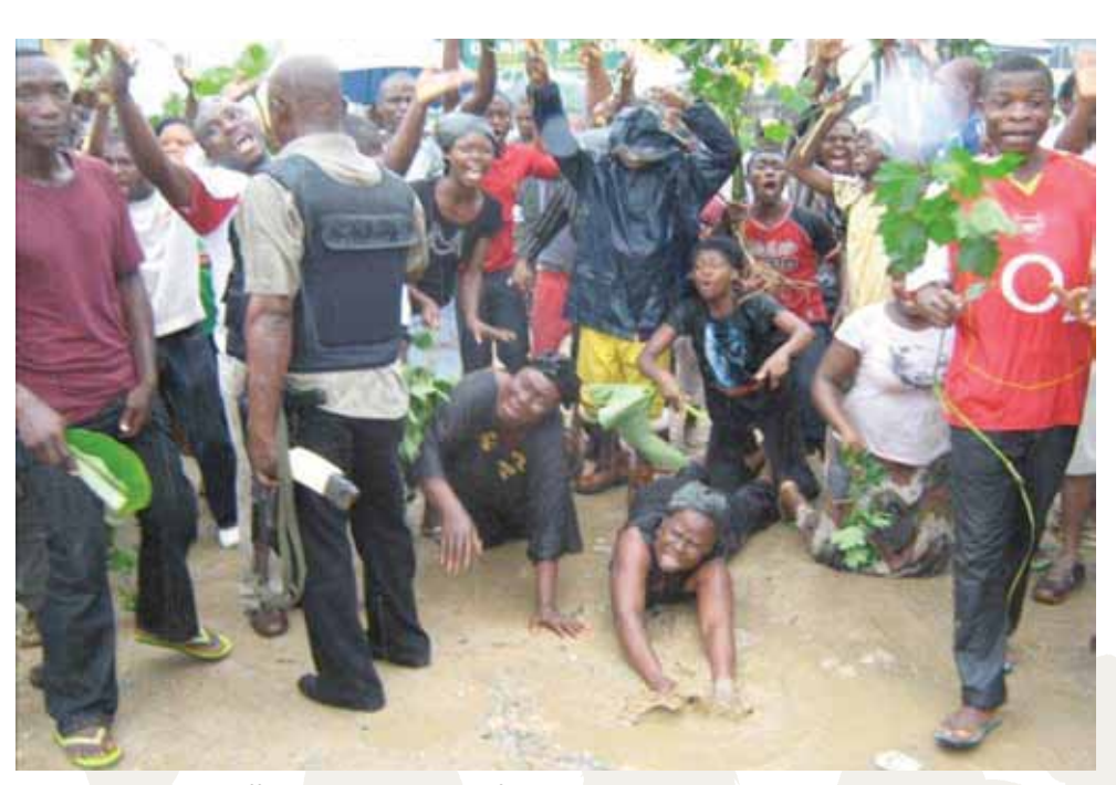
Residents plead with officials on the Ogu waterfront, Port Harcourt, Nigeria, June 30, 2009.

The 10 case studies reflect the following central causes of forced eviction: urban development (Zimbabwe, Dominican Republic, Port Harcourt, Curitiba), large-scale development projects