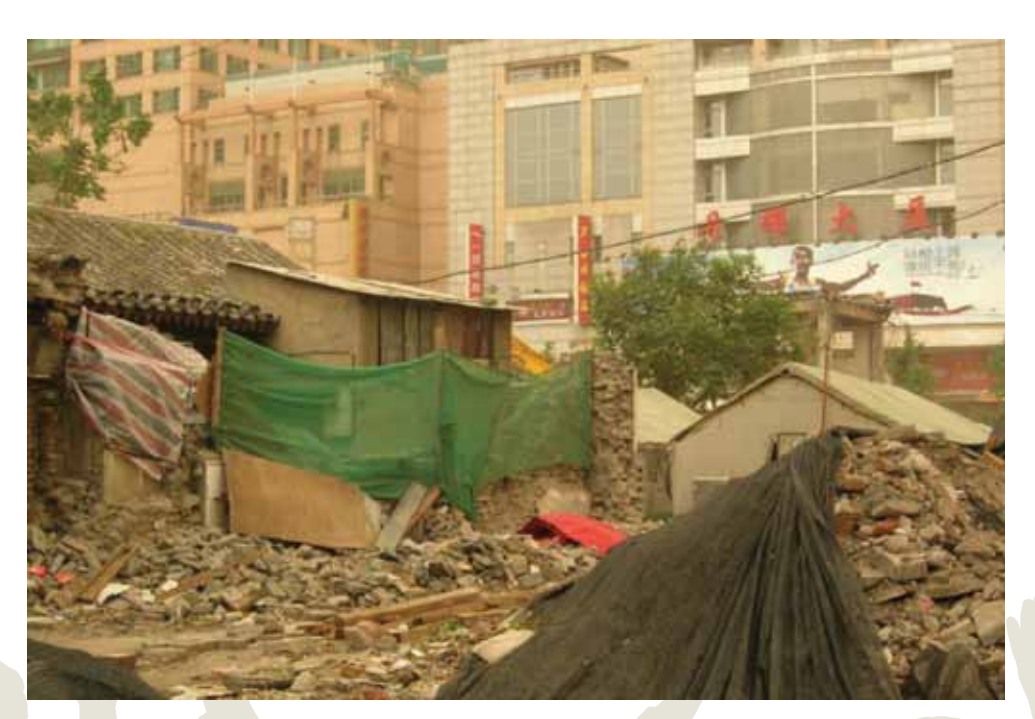
House demolitions ahead of the Beijing Olympics.

In July 2003, Beijing, China was awarded the 2008 Olympic Games. Two days later, following the purchase of land by developers, the first wave of evictions commenced. In September 2003, in the wake of protests,