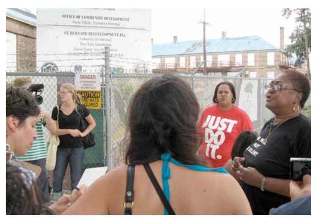
Former residents of the St Bernard Community and members of Mayday New Orleans with AGFE members, New Orleans, United States, July 2009).

virtual community called Save Charity Hospital aimed at re-opening Charity Hospital and retaining the historic community of Lower Mid-City. In Peru, the Tambo Grande community organized itself to form a Defence Front. They mobilized support from diverse groups including other government representatives, national and international institutions, artists, intellectuals. With this broad base of support, the eviction was prevented.<sup>190</sup>