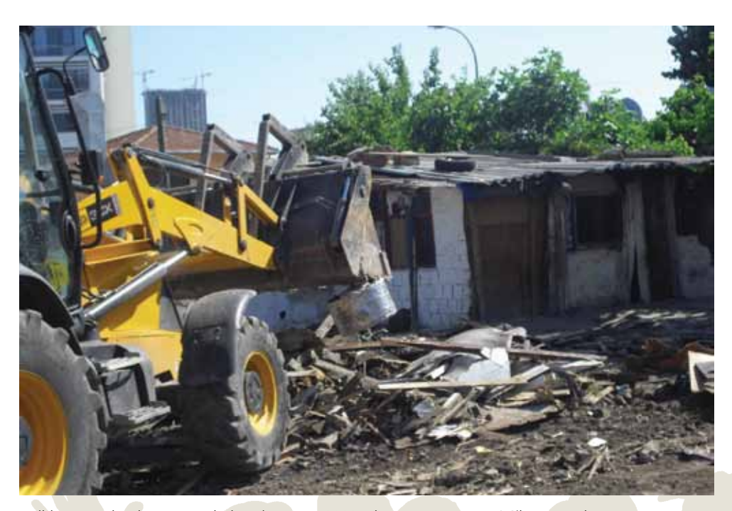
Bulldozer crushes home, Istanbul, Turkey, June 2009.

In Istanbul, Turkey – which has a rapidly increasing urban population<sup>147</sup> – urban renewal projects have affected 80,000 people, with close to 13,000 people having had their homes destroyed. Many more households are being threatened with eviction. This is being driven by cultural mega-events – Istanbul is the European Capital of Culture (2010) and the Central and State authorities are hoping to transform it into a 'global' first class city with modern infrastructure and housing