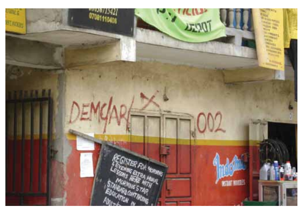
Homes marked for demolition for the Azikiwe Street dualization, Port Harcourt, Nigeria, March 13, 2009.

plan was offered. Around the same time, similar evictions occurred along the railway lines in Kibera. The outcry and community organizing about these and the thousands of other threatened evictions resulted in the governments suspending any further evictions in Kibera. Negotiations and discussions between the government, those affected by potential evictions and other stakeholders have commenced regarding a possible resettlement plan for those living along the rail lines. However, this has not curbed forced evictions in other parts of Kenya. The outcry and community the rail lines.