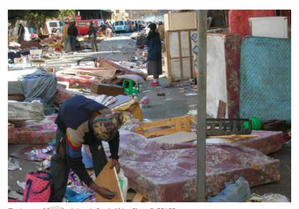
The impact of forced evictions in South Africa.

The Millennium Development Goals (MDGs), derived from the Millennium Declaration, commit States to a new global partnership to address extreme poverty. Though the MDGs are not legally binding, they have significant political weight and are relevant in the context of forced evictions in developing countries. The MDGs were signed by 189 countries, including 147 heads of State and Government, in September 2000<sup>75</sup> and received further endorsement by United Nations member states at the 2005 World Summit (Resolution adopted by the General Assembly). 76 Forced