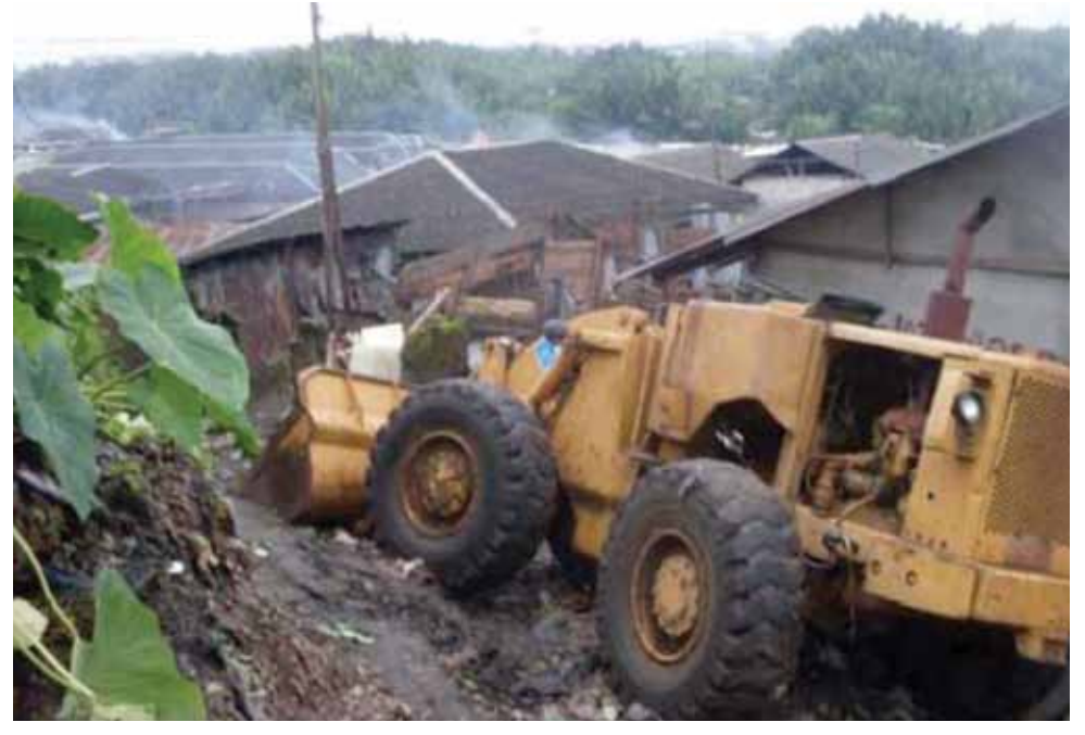
Njemanze demolition, Port Harcourt, Nigeria, March 2009.

land and common property resources."57 The adequacy of alternative lands will be determined on the basis of how much they fulfill the criteria of the right to housing, in terms of providing security of tenure, access to basic services, affordability and habitability.58 It is also important to recognize that certain groups, particularly indigenous communities, have a strong and enduring bond to their land and will often find the offer of alternative land or monetary compensation to be unacceptable.