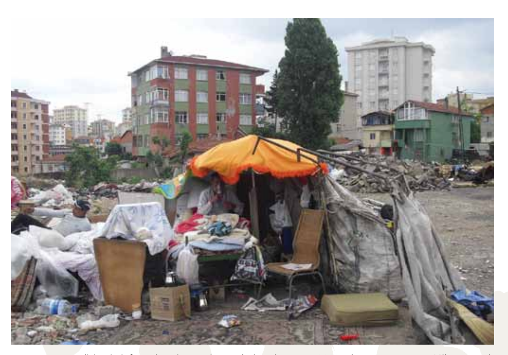
Man on oxygen living in informal settlement in Istanbul, Turkey, June 2009.

In many instances, forced evictions are carried out with the use of force and violence. Tear gas, fires, rubber bullets, and gender-specific violence are often used as means to remove people from their homes. For example, in September 2006, armed police and hired youth evicted approximately 300 families from the Komora slum in Nairobi. Police