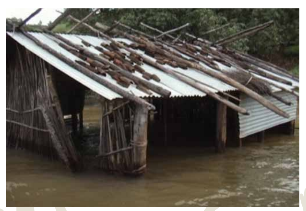
Submergence in the Narmada River Valley, August 2004.

From the Americas to the Pacific to India and Africa, Indigenous peoples are particularly affected by large-scale development projects over-taking small-scale subsistence practices, leading to a lack of environmental sustainability and to the undermining of Indigenous livelihoods. Large scale development projects which lead to forced eviction and displacement are one of the most common causes of Indigenous rural-urban migration. In rural contexts, forced eviction and displacement is often legally feasible because many Indigenous peoples do not have formal titles, deeds or even registration of their ancestral lands.