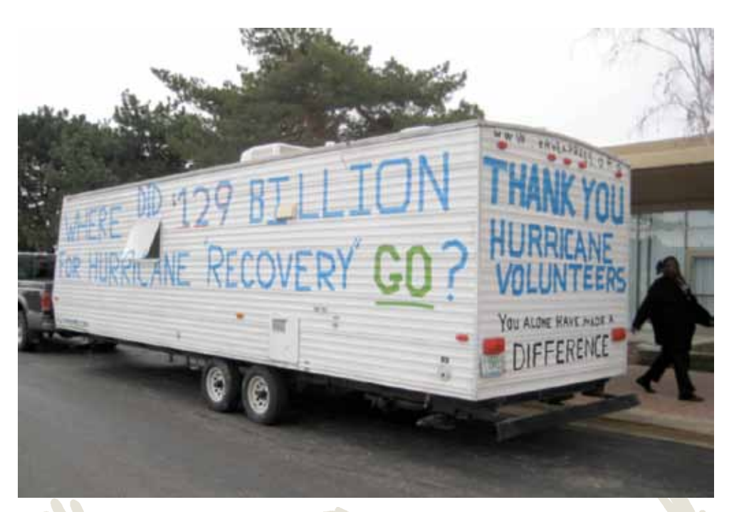
Katrina trailer modified for advocacy, New Orleans, United States, July 2009.

The following two case studies, one from Asia, the other from North America, demonstrate the wavs in which a natural disaster, which tend to devastate the lowest income communities, are often used opportunistically by governments to further a development agenda that conflicts with human rights obligations. In New Orleans, Louisiana, Hurricane Katrina has been used to effectively convert public housing for poor people into private accommodation for middle income earners, similar to what is occurring in New York and Chicago, as noted previously. In Sri Lanka, the December 2004 tsunami was used to create a coastal buffer zone which prohibits residential reconstruction but which allows for the reconstruction of hotels and tourist-oriented establishments. 132