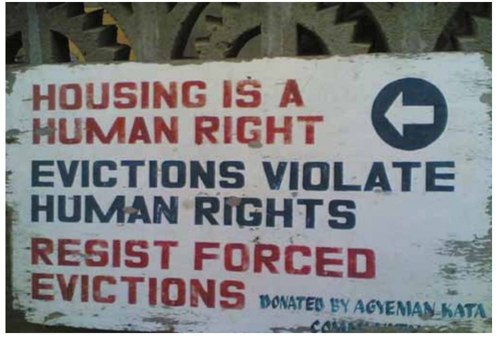
Housing rights poster in Agyemankata, Ghana.

against forced eviction. It is also used outside the context of litigation as an essential tool for affected communities to use in advocacy and campaigns against forced eviction. International human rights law is sometimes referred to as 'soft law', particularly with respect to economic and social rights like the right to adequate housing, on the basis that it is difficult to enforce and acts more as a shaming mechanism than 'black letter' law. This perception is, however, out-dated and incorrect. As this report reveals, economic and social rights are being litigated in different iurisdictions around the world and this litigation is based on international human rights principles. For example, a recent case of forced eviction was brought to the Kenyan High Court, Susan Waithera Kariuki & 4 others v Town Clerk, Nairobi City Council & 2 others. In that case, the presiding judge interpreted the right to adequate housing – enshrined in the Kenyan Constitution – and what that right requires in the face of forced eviction,