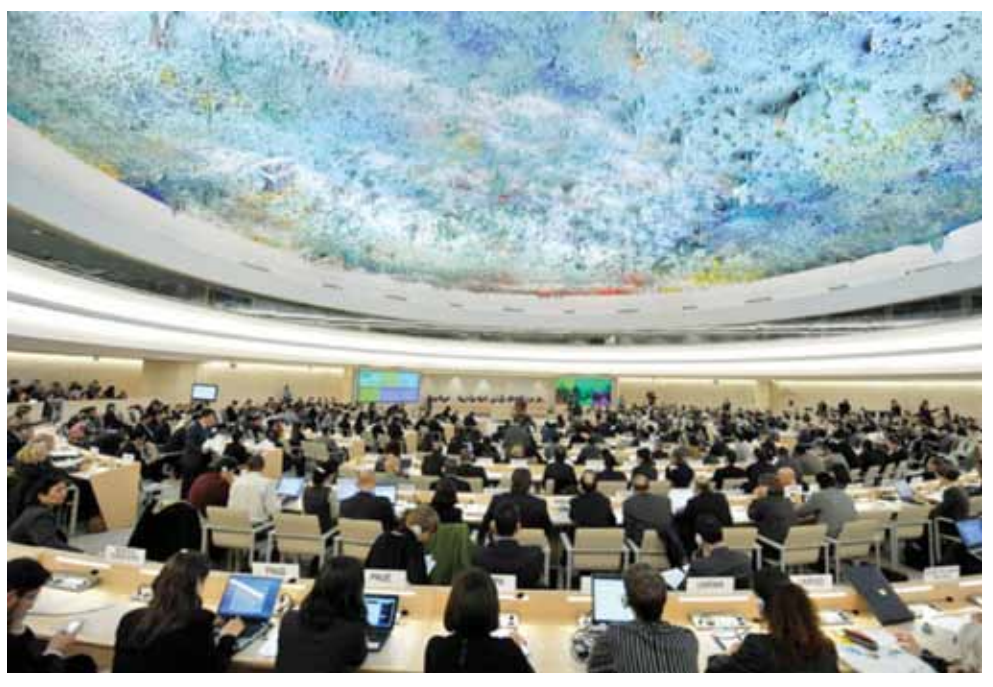
United Nations delegates listen to review of the United States' human rights record in Geneva, November 5, 2010.

The Universal Periodic Review (UPR) is a relatively new human rights mechanism administered through the United Nations Human Rights Council. It is essentially a peer review process, whereby States review the compliance of other States with respect to international human rights norms and obligations. Every Member State to the United Nations is reviewed under this mechanism every 5 years, whether or not they are a member of the United Nations Human Rights Council. Though the recommendations that emerge from this review process do not have the force of law, they have significant political weight. To date, the UPR has been taken quite seriously by most States. The UPR process is meant to create dialogue between States and NGOs. In its preparations for the UPR, States are expected to engage in meaningful consultations with