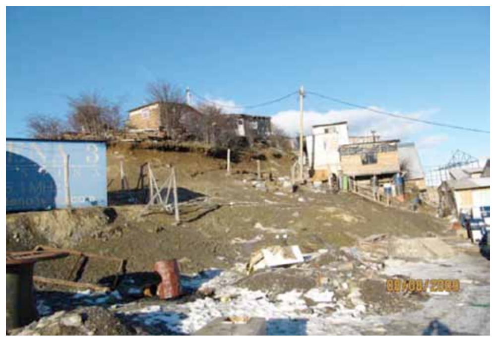
AGFE mission to Ushuaia, Argentina, August 8, 2009.

Municipal, State and Federal Government representatives, representatives from the affected communities, popular movements in the struggle for housing, non-governmental organisations, universities, professionals, and students. Those who attended the public hearing agreed to establish a Working Group (equally represented by civil society and government), with the objective of proposing measures to prevent forced evictions and to promoting solutions to the cases presented at the public hearing by the affected communities. Due to social pressure which resulted from the public hearing held by AGFE, the public land belonging to the Company of Popular Habitation of Curitiba was transferred to the Municipality of Contenda (the metropolitan area of Curitiba) in payment of land taxes debits. The land is to be used for the construction of social housing. Also, the 290 inhabitants of the Village Audi, situated in