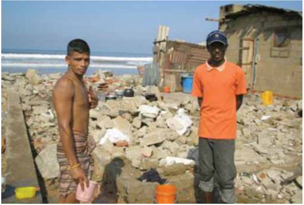
Tsunami survivors in Sri Lanka try to rebuild their lives, March 2005.

Local governments often play innovative roles in preventing or halting forced evictions, despite their relative lack of power within the housing context. AGFE has documented and influenced creative practices by local governments to halt forced evictions. For example, in the French Municipality of Bobigny, near Paris residents – primarily working class immigrants living in public housing – were facing a growing number of evictions due to arrears in rent. The Mayor responded to the situation issuing a municipal decree declaring the municipality a "territory free of evictions." Though this decree was declared invalid in court, it triggered similar decrees in other municipalities and public debate on forced evictions. The result was that evictions slowed down.<sup>202</sup> Similar decrees were discussed and considered as a result of AGFE missions to Dominican Republic and to Rome.