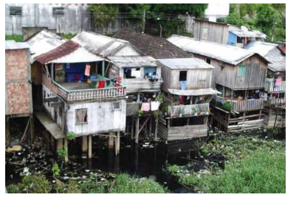
Manaus City in Northern Brazil.