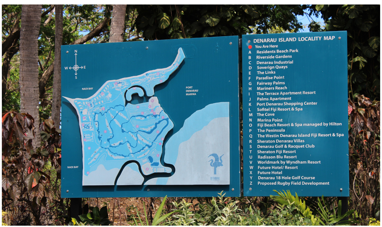
Denarau Island Development

impact of climate change on tourism may be highly relevant for environmental review of tourism related developments in urban and peri-urban areas. The Climate Change Policy further states that the tourism sector may face some challenges due to climate change including buildings and infrastructural damage; disruption in transport network; a decrease in the number of tourist arrivals; adverse changes in natural attractions; increase of costs for adaptations; and a decrease of touristic capital investments due to climate impact.51