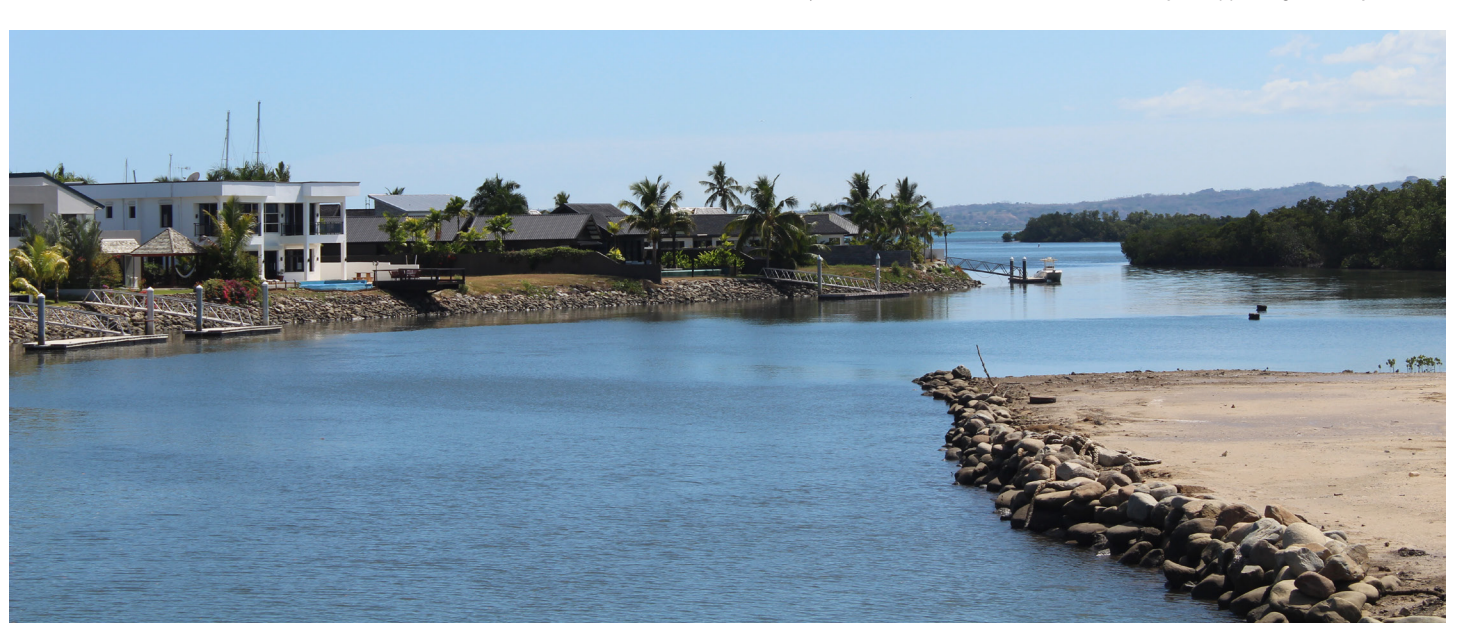
Denarau Island Development

'is referred to the EIA Administrator by an approving authority;