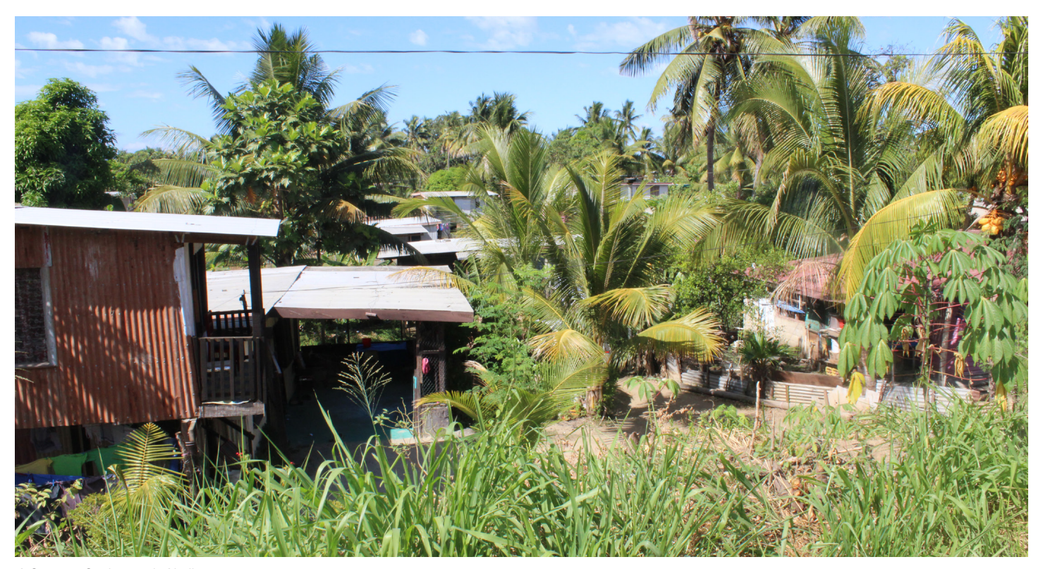
A Squatter Settlement in Nadi