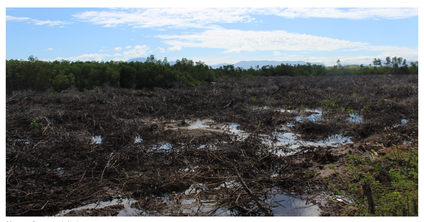
Mangrove Destruction in Nadi

protested the mangrove destruction. Today the Vanua [land] of Nadi is facing numerous floods that are partly linked to the clearing of mangroves in Denarau Island and Denarau Island's beach front sand erosion... In terms of livelihood, we have lost forever our mangrove food source, while we gained some source of employment for our villagers. At that time no proper economic analysis on the opportunity cost foregone for clearing the mangroves for the golf course was undertaken..."44