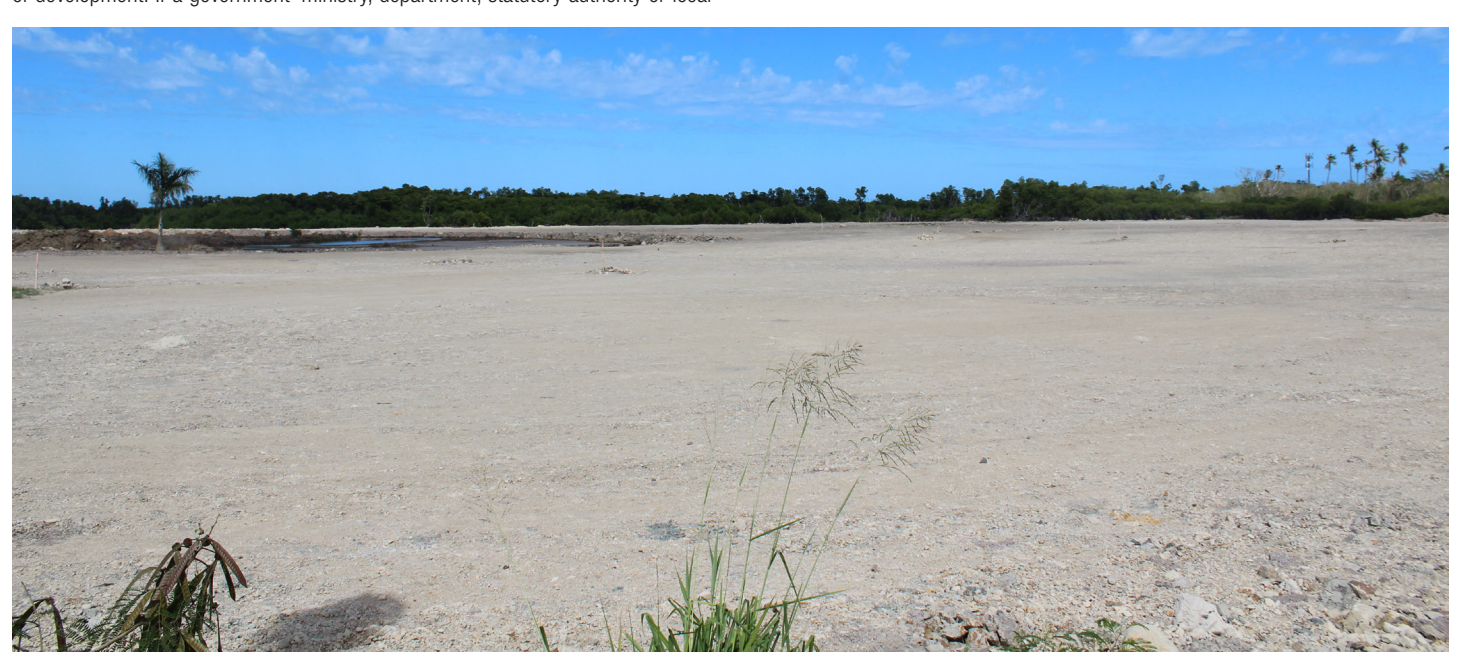
Landfilling After Mangrove Destruction in Nadi

For further elaboration of these provisions, the Fiji government adopted the Environment Management (EIA Process) Regulations, 2007. The Regulations elaborated provisions for screening, EIA processing, and the EIA Study and Report. A very important provision of the guidelines is the clarification regarding development projects by government ministries and entities. According to these regulations, if a government ministry or other government entity proposes a development activity or undertaking for which it would otherwise be the approving authority, it must apply to the EIA Administrator wherein the EIA Administrator performs the role of the approving authority. However, the power of screening is conferred upon the environmental management unit of the proposing government entity, 68 which may create some problems. The Department of Environment also published the