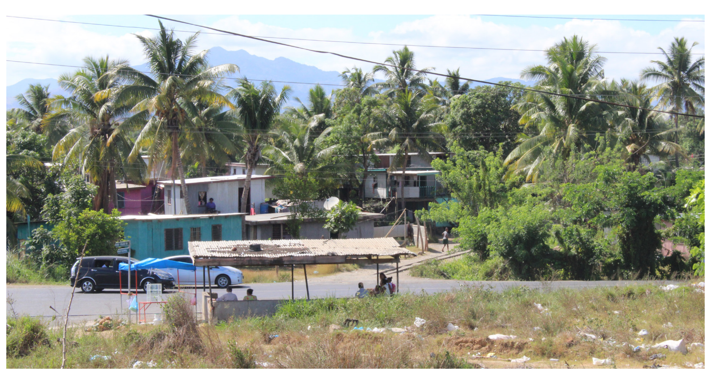
A Squatter Settlement in Nadi

surrounding peri-urban areas) the town is experiencing a population growth of 2.5% per year.<sup>33</sup> Economic activities of Nadi rely mainly on three interconnected sectors: tourism, transport and real estate.<sup>34</sup> Growth in the tourism sector has changed the land use pattern of Nadi and surrounding area from predominately residential to tourism related development. However, the effectiveness of environmental review of tourism related development projects is questionable. This will be elaborated here with an example from the Denarau island development.