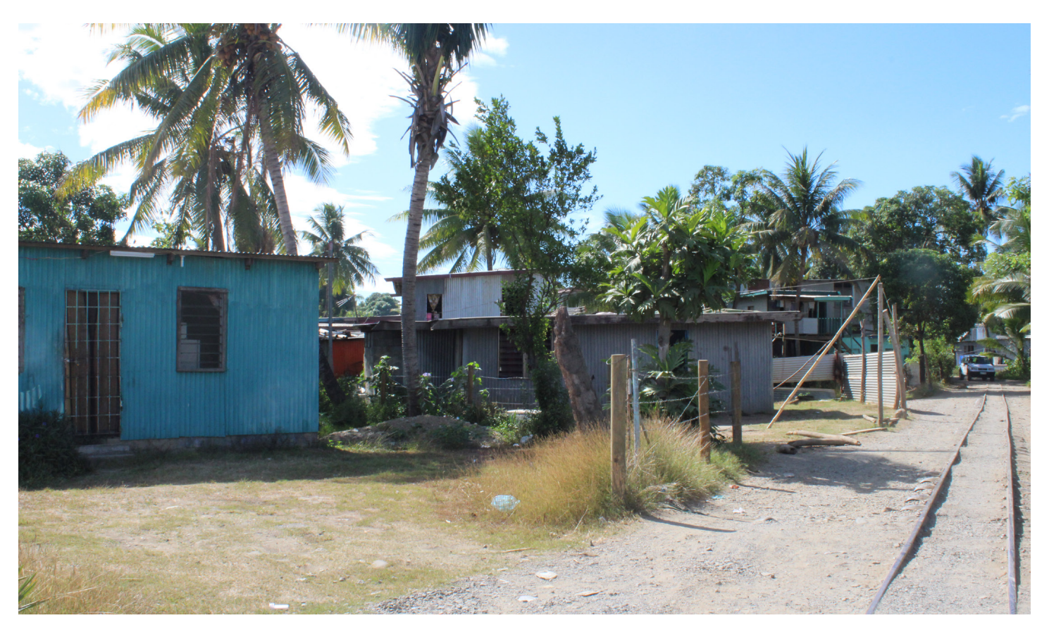
A Squatter Settlement in Nadi