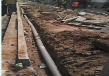
Figure X: Clockwise from top; Alley paving providing labor to local youth and results of alley block paving providing much needed public spaces. Sewer lines to improve sanitation were also rehabilitated (bottom right)