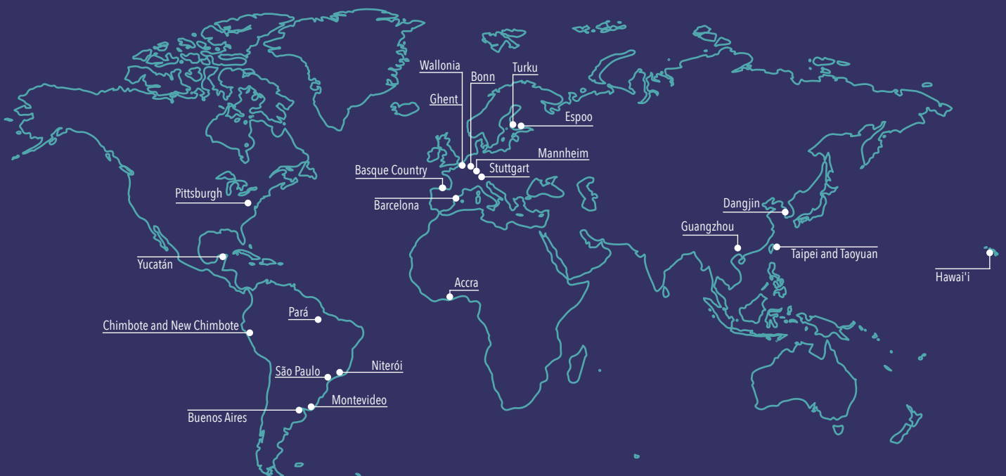
Figure 1: Map of VLRs presented in 2020

The first analytical theme is the governance structure of the VLR process itself and how this can also influence overall SDG governance in local governments. This is an important issue since VLRs can “help to overcome the often silo approach of local governance” 28 , thus advancing a more holistic