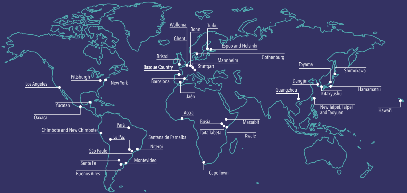
Figure 4: Map with all identified VLRs (2018-2020)