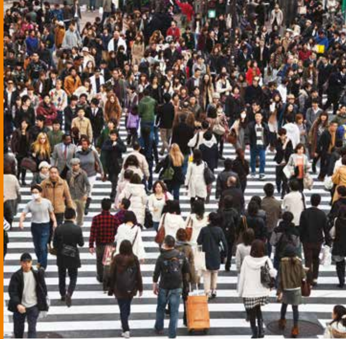
Pedestrians in Tokyo, Japan

Urban and territorial planning can contribute to sustainable development in various ways. It should be closely associated with the three complementary dimensions of sustainable development: social development and inclusion, sustained economic growth and environmental protection and management.