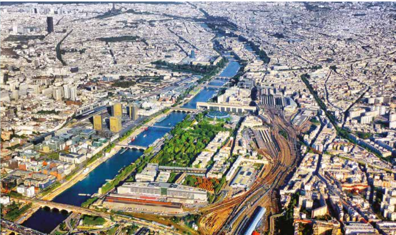
Aerial view of Paris, France