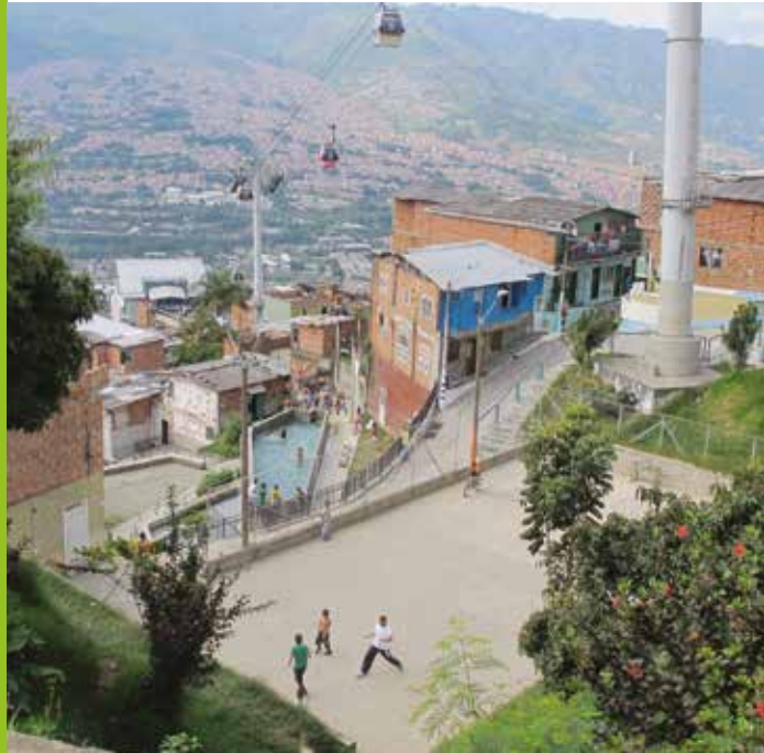
Public space in Medellín, Colombia