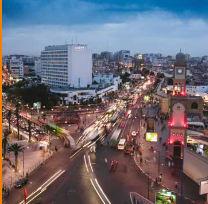
The United Nations square in Casablanca, Morocco