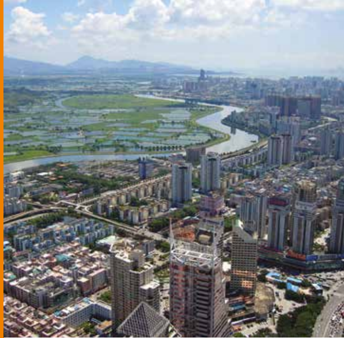
Aerial view of Shenzhen, China