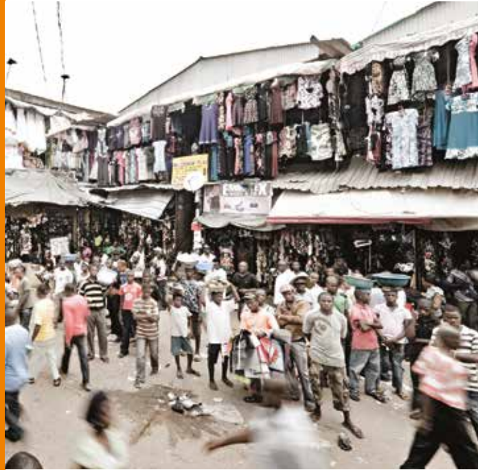
Market place at Onitsha, Nigeria