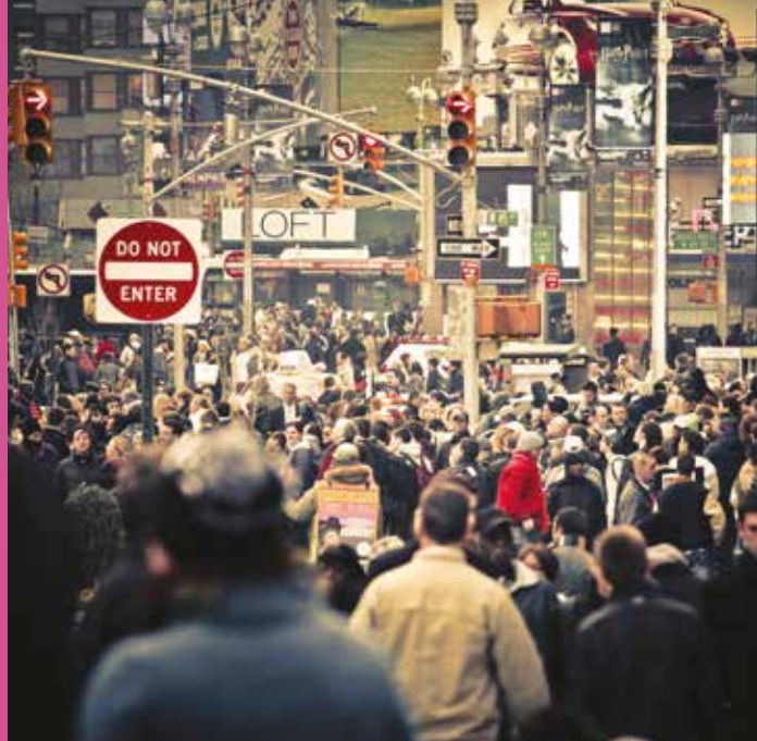
Street in New York, USA