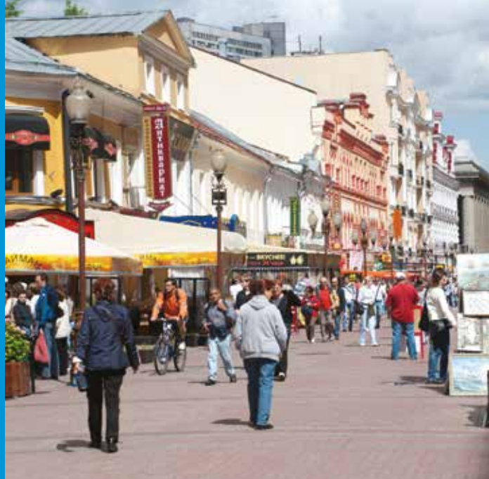
Pedestrian street in Moscow, Russia