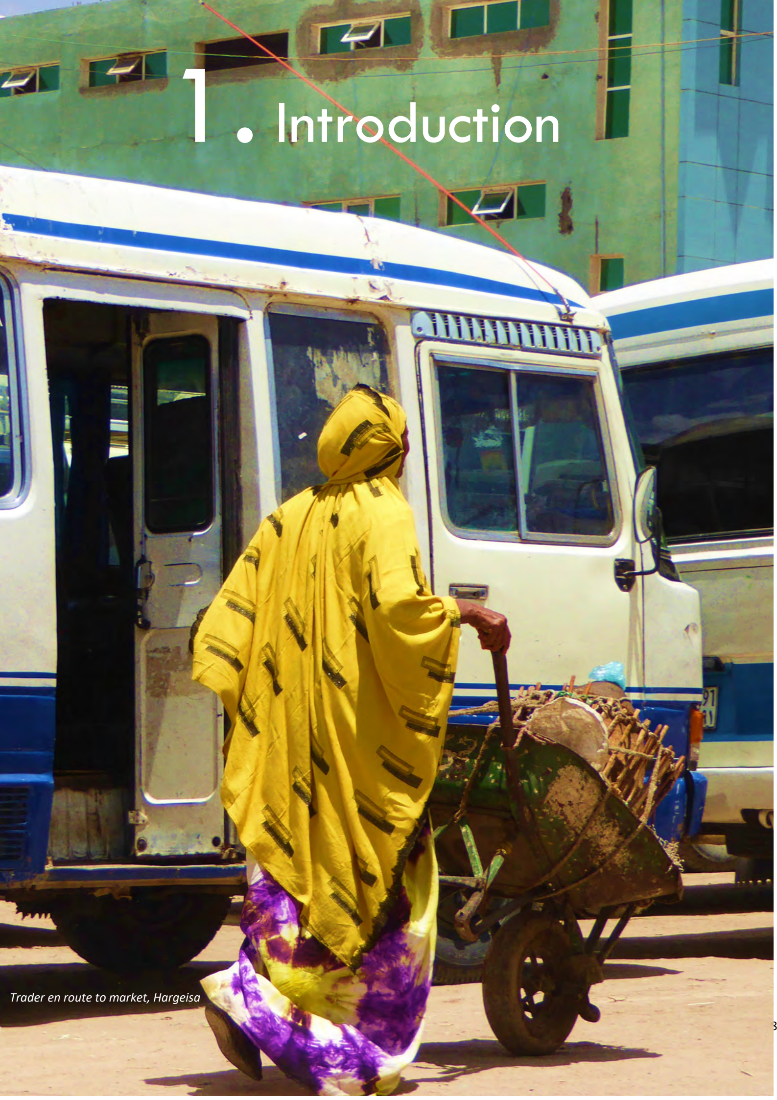
Trader en route to market, Hargeisa