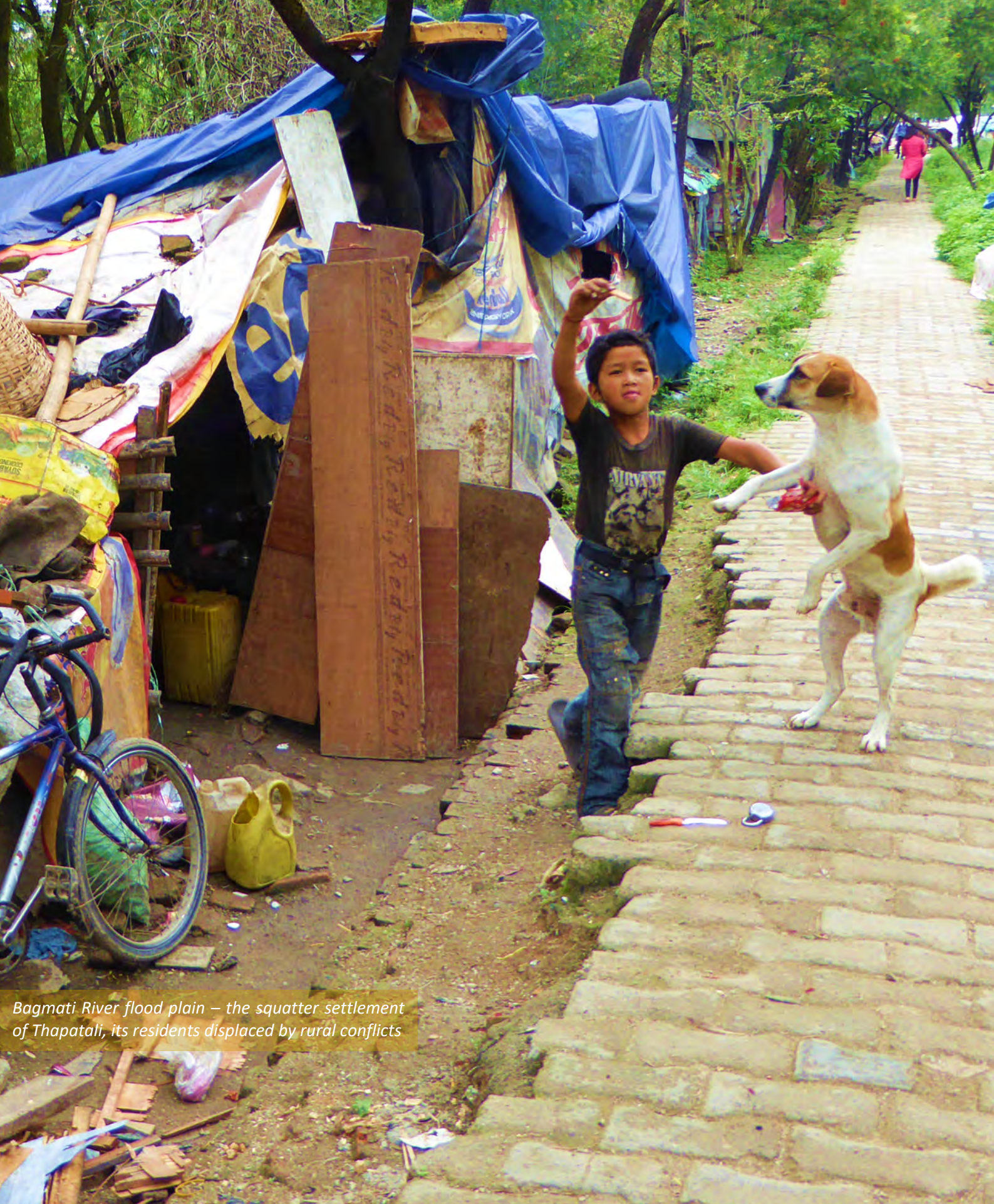
Bagmati River flood plain – the squatter settlement of Thapatali, its residents displaced by rural conflicts