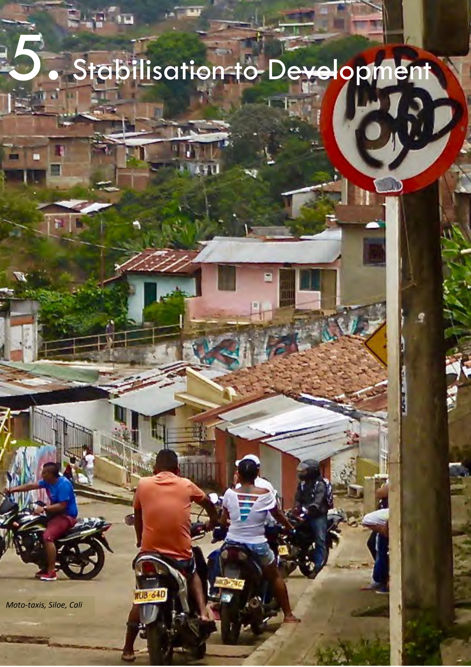
Moto-taxis, Siloe, Cali