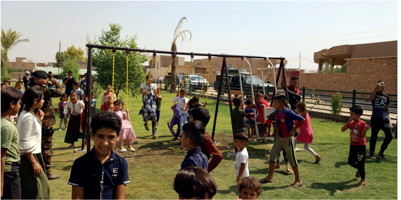
Ramadi kids in Iraq benefiting from public space